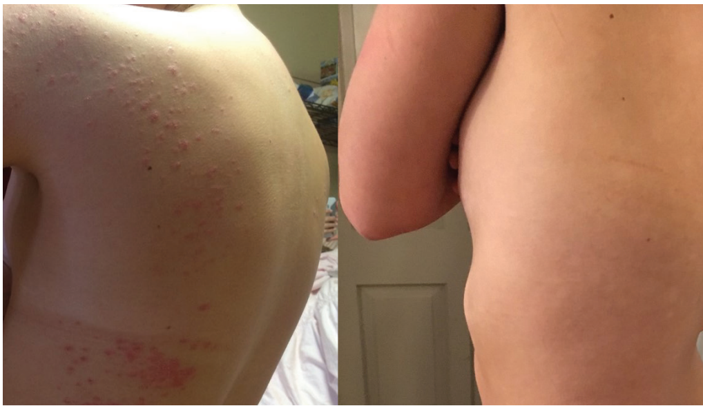
Figure 1A-B. Psoriatic papules and plaques on the lateral back, abdomen, and flank before (A) and three months after (B) tonsillectomy.