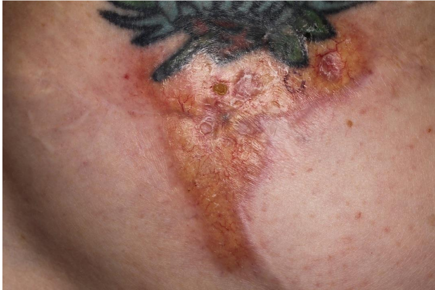
Figure 1. Physical exam revealed an irregularly shaped yellow atrophic plaque with telangiectasia and surrounding erythema within a scar on the breast.

reported a positive family history of skin cancer. Physical examination revealed a 5.5 x 4.9 cm irregularly shaped atrophic yellow-red plaque with telangiectasias and underlying erythema at the site of a former mastectomy incision on the left breast (Figure 1). No cutaneous anesthesia was noted. A 4mm punch biopsy was performed and the specimen was stained with hematoxylin-eosin.