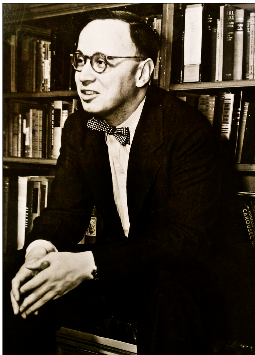
Above left, Norman Thomas engaged in conversation (circa 1945); above, Sidney Hook at the Congress for Cultural Freedom's September 1955 Future of Freedom Conference in Milan, Italy; left, Arthur Schlesinger Jr. promotional photo (circa 1950).