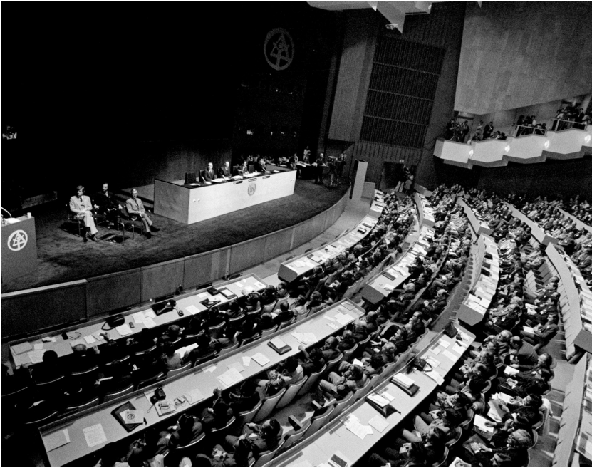
Figure 8:

Africa, was completed in 1961 and is the site for the founding of the Organization of the African Unity which became the African Union in 2002. The groundwork for African unity was conceived within a theatre of the round (Figure 9).