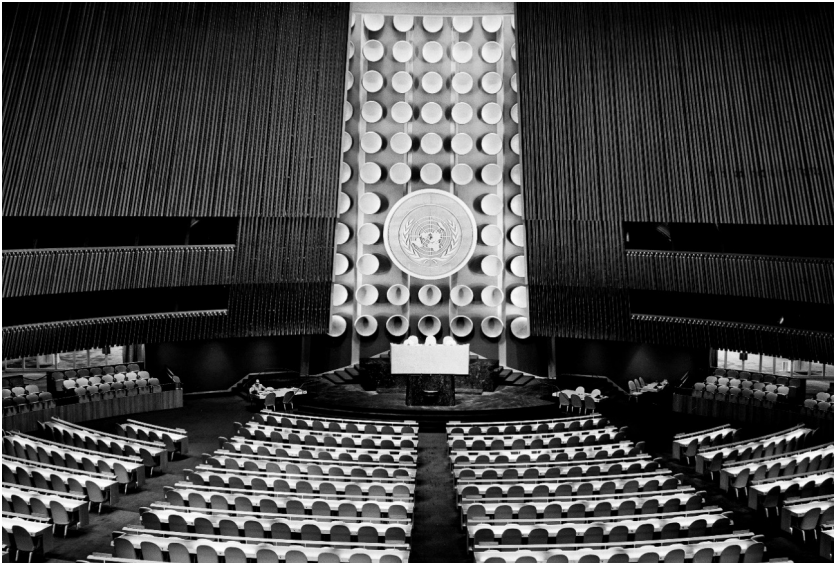
Figure 11: UN photo #70477.