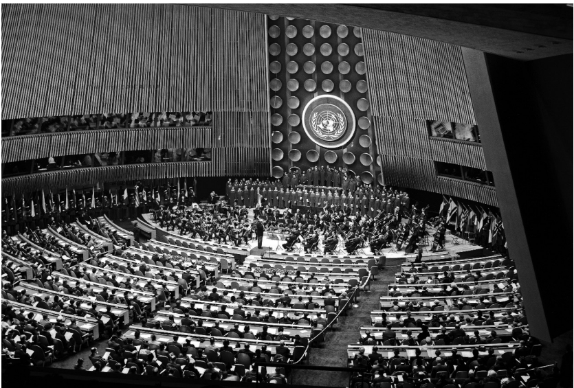
Figure 12: