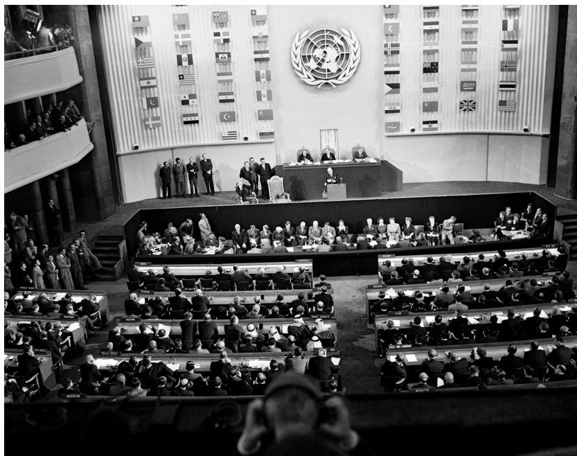
Figure 5: UN photo #113909.

state, but is considered the “people’s national theater.” (Figure 5).