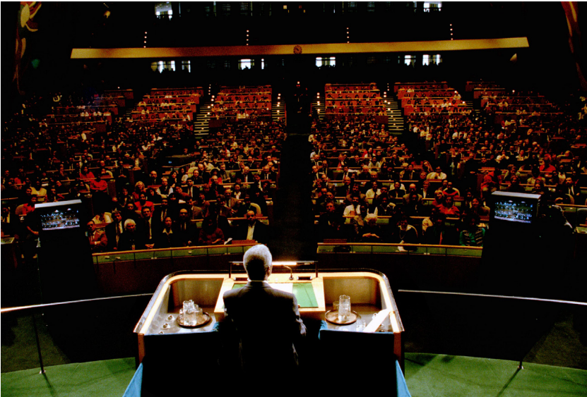
Figure 14: UN photo #27312 by Sophia Paris.