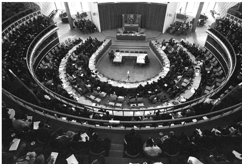
Figure 9: UN photo #379484.