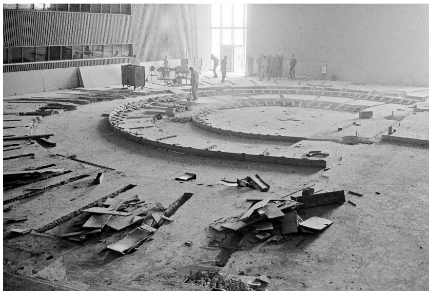
Figure 10: