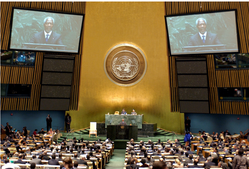
Figure 15: UN photo #1919 by Milton Grant.