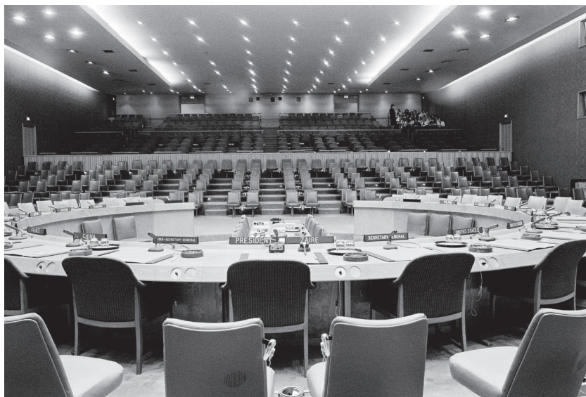
Figure 13: UN photo #102866 by Milton Grant.

Capable of accommodating more than 1,800 people, this space—designed by American architect Wallace Harrison and his international Board of Design Consultants—allows for all the representatives of Member States to gather to discuss the most pressing problems of the day and convene convivially come evening. (Figure 11-12).