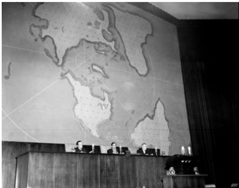
Figure 7: UN photo #170170.

delegates, when meeting in other cities, have often held their meetings in performing arts centers. Such was the case with HABITAT: the UN Conference on Human Settlements in 1976, when delegates convened on the Queen Elizabeth Theatre in Vancouver, Canada to discuss the problems of rapid, unplanned urban growth. One of the largest proscenium theatres in Canada, the Queen Elizabeth typically hosts opera performances, Broadway productions, and popular music concerts (Figure 8).