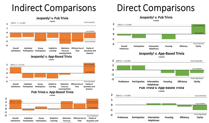
Figure 2. Graphical representation of results.