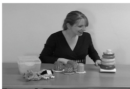
Coarse-unit slide depicting completed ring assembly; actor next moves to cups