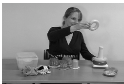
Within-unit slide depicting actor in the middle of placing medium ring

Participants were 14 3-year-olds ( M = 41.5 months, SD = 3.96 ; 9 male) and 12 4-year-olds ( M = 53.08 , SD = 3.70 ; 5 male). The experiment consisted of two brief training phases, followed by the main slideshow task and the memory test. Images in the slideshow were presented on