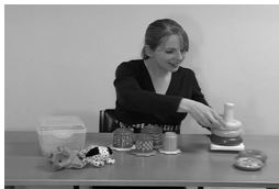
Fine-unit slide depicting actor completing placement of medium ring