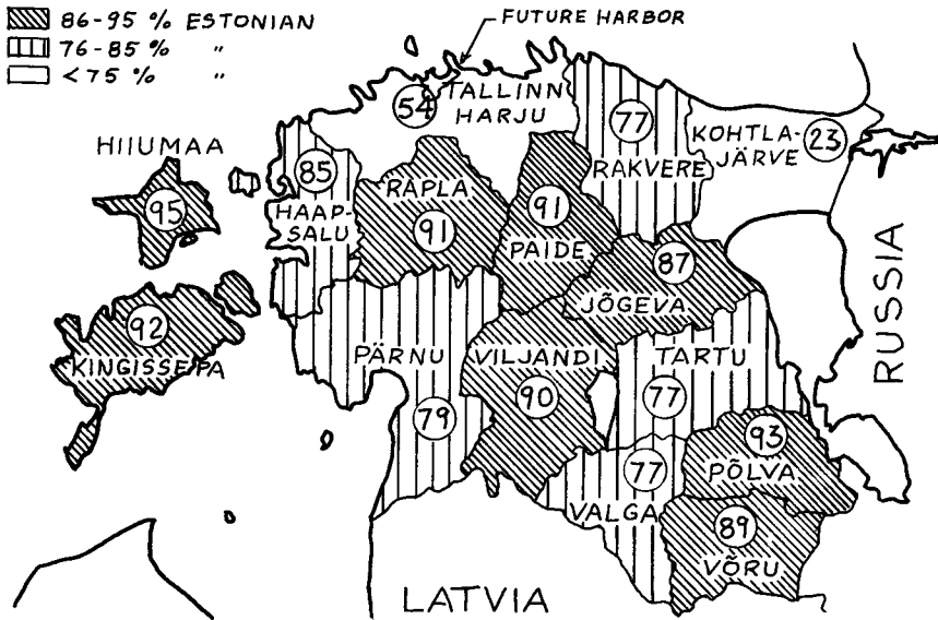
Figure 2. Percentage of Estonians in the Total Population of Districts in 1979 (Including Urban Areas)