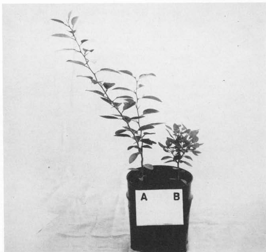
Fig. 1. Reaction of lime seedlings to graft-inoculation with different parts of a single shoot from a heat-treated infected lime plant: A) mild infection from the lower half of shoot B (see fig. 2); B) severe infection from the tip half of the same shoot.

The two halves of a single shoot from each of two heat-treated plants, when used as scions to inoculate two lime plants, caused different reactions on the test plants. In the following discussion these separate shoots are referred to as shoot A and shoot B. In each case one of the test plants inoculated with one half of the original shoot exhibited mild symptoms, while the test plant inoculated with the other half exhibited