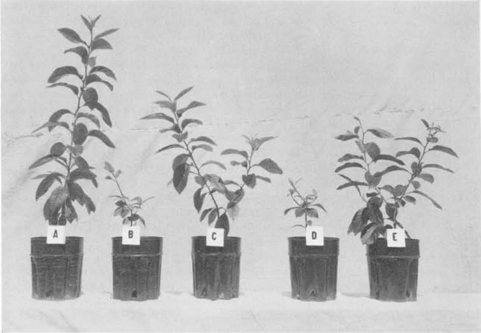
Fig. 3. Reaction of lemon seedlings to the two virus strains obtained from shoot B of infected, heat-treated lime seedling: A) self-grafted, noninoculated lemon seedling; B) and C) lemon plants inoculated, respectively, from plants A and B (shown in fig. 1); D) and E) lemon plants inoculated from the same respective sources two months later.