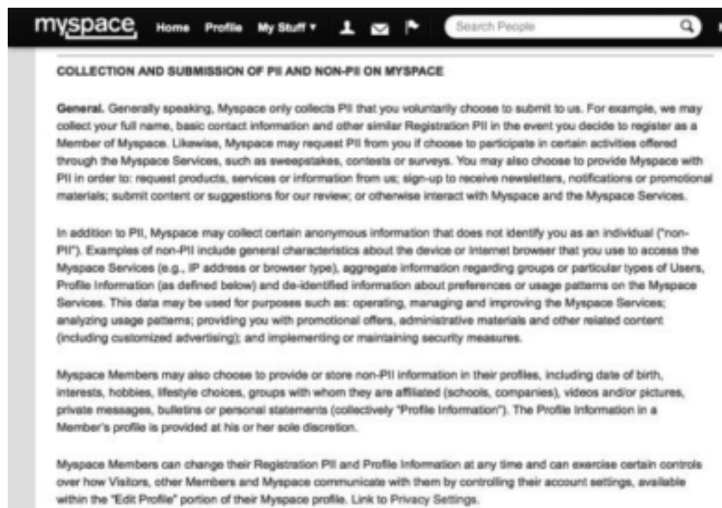
Figure 1. MySpace privacy policy.

An important function blogging provides for users is an outlet to share emotions with a community and receive feedback. 3 Prior to the advent of blogs, journals were used as a coping strategy, and multiple studies have shown that this remains an effective therapeutic tool, leading to a revitalization of the author’s physical, emotional, and psychological health, and improving social functioning. 13-17 In 2006 a study found that 70% of blogs were considered