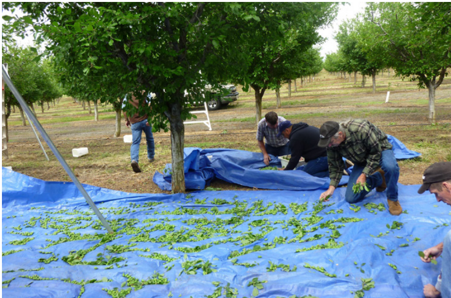
Figure 2. Green fruit removal from a representative prune tree to assess thinning needs. Fruit are hand-picked and dropped on to canvas tarps. They are gathered and weighed. The total number of fruit on the tree is estimated based upon the total weight of all fruit picked from the tree and the weight of a 100-fruit subsample.

Water management is critical to successful commercial prune production. An over-cropped prune orchard with limited water application may generate a sparse leaf canopy, producing small prunes of poor quality. Large amounts of low-quality and low-value fruit add weight on the tree limbs that compromises tree structure, expose bearing limbs to sunburn, and create entry points for diseases to infect the trees and threaten their long-term viability. Prune crop load is a key component and can be manipulated to make any drought management strategy more successful. Crop thinning (figure 2) is a practice that improves fruit quality and value so that, even though the crop yield may be limited by a water shortage, the trees will still produce valuable, marketable fruit. Crop load management also prevents damage to the trees' structure and a higher potential for diseases that may persist long after the drought ends.