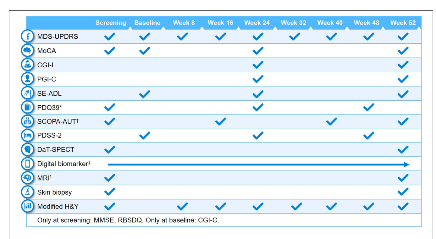
FIGURE 2 | Schedule of activities in PASADENA Part 1. *Parkinson's Disease Questionnaire—39 (PDQ39) is at baseline, Week 20, and Week 48; †SCOPA-AUT (Scales for Outcomes in Parkinson's Disease—Autonomic Dysfunction) is at baseline, Weeks 16, 28, 40 and 52. †Digital includes PASADENA Digital Motor Score, Patient Global Impression of Severity, Daily diary, Patient Assessment of Constipation Symptoms (PAC-SYM), EuroQol-5D (EQ-5D) and Hospital Anxiety and Depression Scale (HADS). *Magnetic resonance imaging (MRI) includes safety, diffusion tensor imaging (DTI), resting state and arterial spin labeling (ASL). CGI-C, Clinical Global Impression of Change; CGI-I, Clinical Global Impression of Improvement; DaT-SPECT, dopamine transporter imaging with single-photon emission computerized tomography; H&Y, Hoehn & Yahr; MDS-UPDRS, Movement Disorder Society—Unified Parkinson's Disease Rating Scale; MMSE, Mini Mental State Examination; MoCA, Montreal Cognitive Assessment; PDSS-2, Parkinson's Disease Sleep Scale Revised Version 2; PGI-C, Patient Global Impression of Change; RBDSQ, Rapid Eye Movement Sleep Behavior Disorder Screening Questionnaire; SE-ADL, Schwab and England Activities of Daily Living.

baseline at Week 52 in MDS-UPDRS sum of Parts I + II + III vs. placebo.