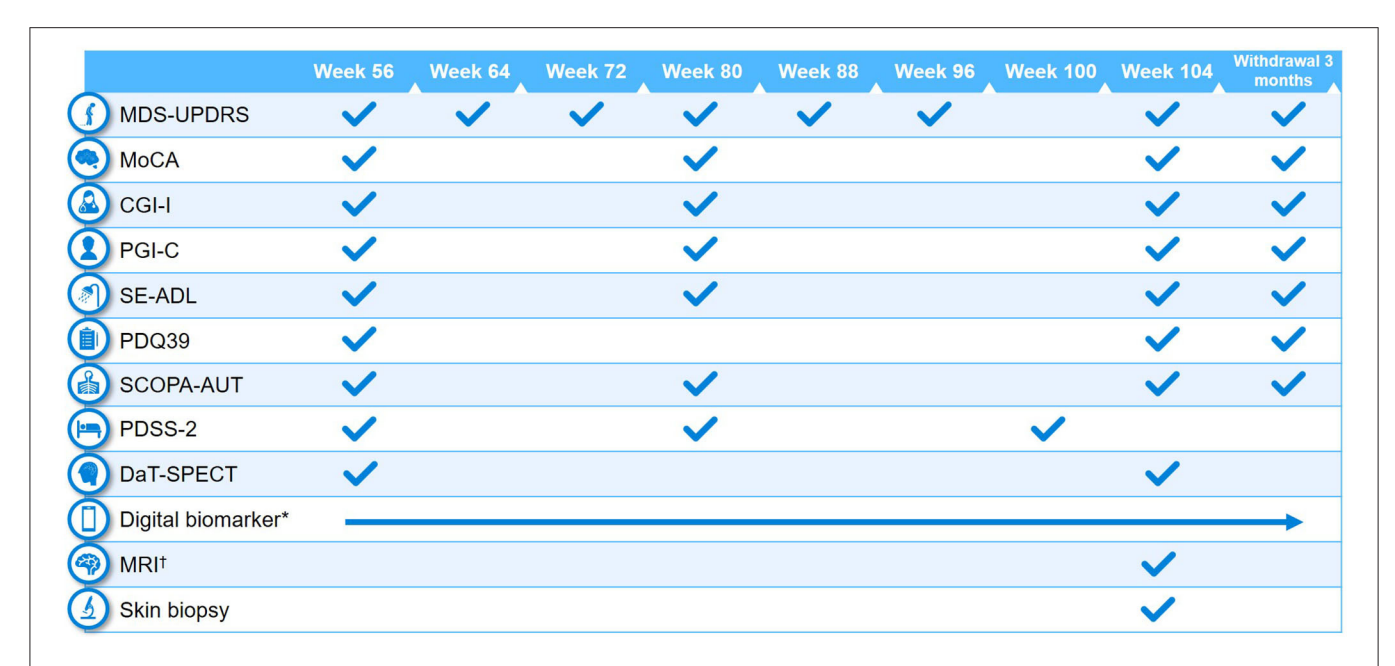
FIGURE 3 | Schedule of activities in PASADENA Part 2. *Digital includes PASADENA Digital Motor Score, Patient Global Impression of Severity, Daily diary, Patient Assessment of Constipation Symptoms (PAC-SYM), EuroQol-5D (EQ-5D), and Hospital Anxiety and Depression Scale (HADS). †Magnetic resonance imaging (MRI) includes safety, diffusion tensor imaging (DTI), resting state and arterial spin labeling (ASL). CGI-I, Clinical Global Impression of Improvement; DaT-SPECT, dopamine transporter imaging with single-photon emission computerized tomography; MDS-UPDRS, Movement Disorder Society—Unified Parkinson's Disease Rating Scale; MoCA, Montreal Cognitive Assessment; PDQ39, Parkinson's Disease Questionnaire—39; PDSS-2, Parkinson's Disease Sleep Scale Revised Version 2; PGI-C, Patient Global Impression of Change; SCOPA-AUT, Scales for Outcomes in Parkinson's Disease—Autonomic Dysfunction; SE-ADL, Schwab and England Activities of Daily Living.