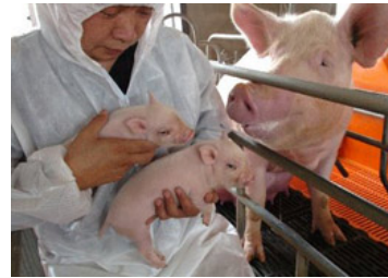
Figure 3: Pigs may serve as a valuable source of organs and cells for transplantation into humans.

Clearly, genetic engineering and transgenics represent fields with myriad potential practical applications that are of value to patients and physicians, as well as potentially lucrative research and innovation streams for commercial and industrial consideration.