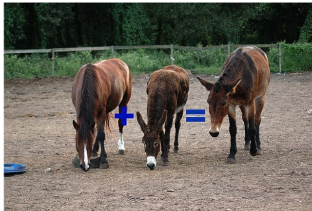
Figure 1: The mule is a common example of a transgenic organism created when a horse and a donkey mate and produce offspring.

Genetic engineering, or genetic modification, uses a variety of tools and techniques from biotechnology and bioengineering to modify an organism's genetic makeup. Transgenics refers to those specific genetic engineering processes that remove genetic material from one species of plant or animal and add it to a different species. Due to the high similarity in genetic sequences for proteins among species, transgenic organisms are able to effectively assimilate and express these trans-genes.