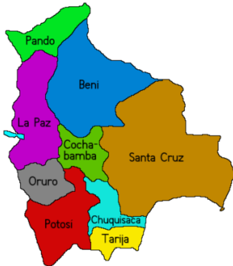
Figure 1.2 Departmental map of Bolivia.