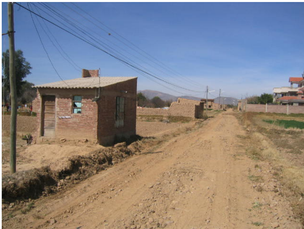
Figure 2.3 My favela.