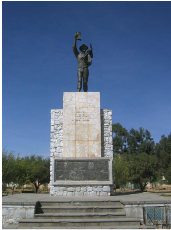
Figure 4.1 The statue of El Campesino .

With confidence I told him that it was El Campesino , a model campesino from the high valleys who represented the campesino movement that culminated in the agrarian reform of 1953. He responded: “Well it looks like your studies have failed you. Take a closer look. Do campesinos look like that?” I was confused. I knew that this statue was called “El Campesino.” So who or what could it represent?