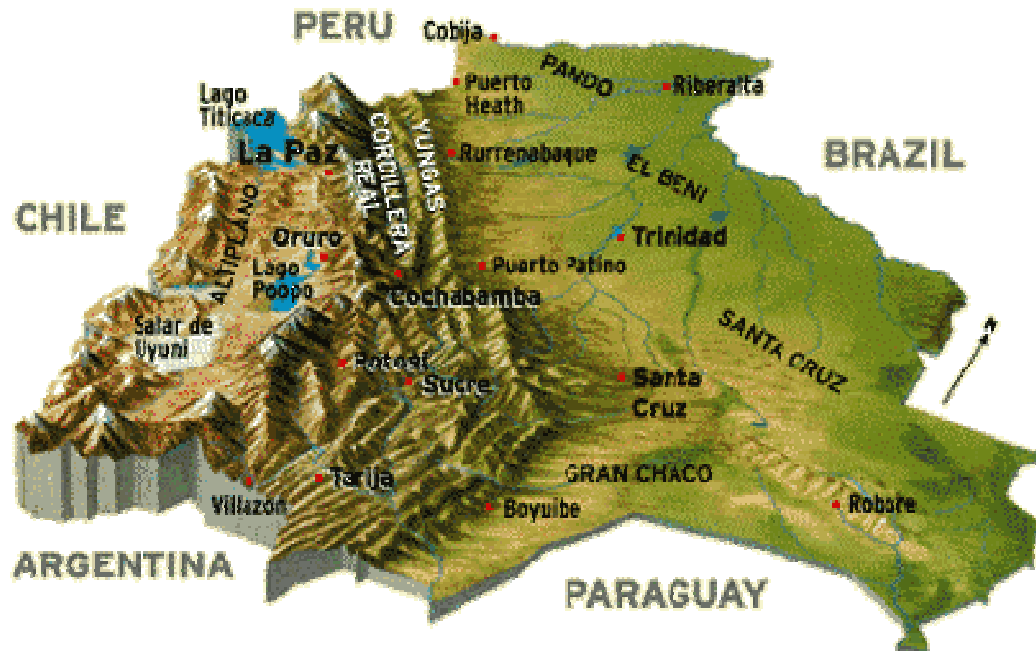
Figure 1.1 Topographic map of Bolivia.

lineage, outlining a key overlap between autobiographical and collective memory. Finally, I demonstrate how power is exercised in the ability to control the connotation of important representations of the past through investigating how these representations are catalysts for organization and mobilization by political parties and social movements. In this capacity, I show that representations of the past reflect, but are also used to construct, meaningful social distinctions and differentiation in the present.