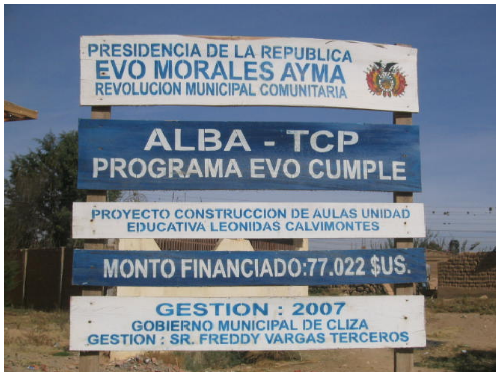
Figure 4.2 Evo builds a school.

Works, such as the building of this school, that give direct credit to Evo Morales and MAS, are common in the central highlands. In turn, the central highland region has overwhelmingly supported Morales and his MAS party in all elections. Their mutually “articulated” (Hall 1986) interests have brought them together in a strategic and reciprocally beneficial partnership.