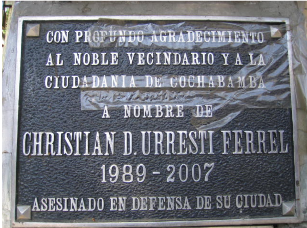
Figure 2.2 Plaque for Christian D. Urresti Ferrel

In the months that followed, fresh flowers remained ever-present, and new commemorations were added regularly. The most significant tribute was an official plaque that was placed there: