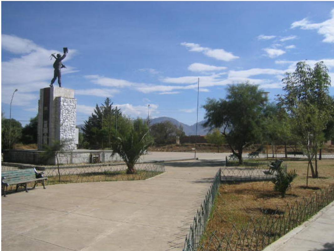
Figure 7.1 Central plaza of Ucureña.

Ucureña is a small community in the high valley of the central highlands. It has an unimpressive plaza with scattered benches and trees, surrounded by a few elementary schools and churches on the dirt-lined periphery of the concrete plaza. On August 2 nd of every year, more than 100,000 people arrive from all over the country to celebrate the first agrarian reform in Bolivian history. This giant influx of visitors is a chaotic affair, but it presents the community with national attention once every year.