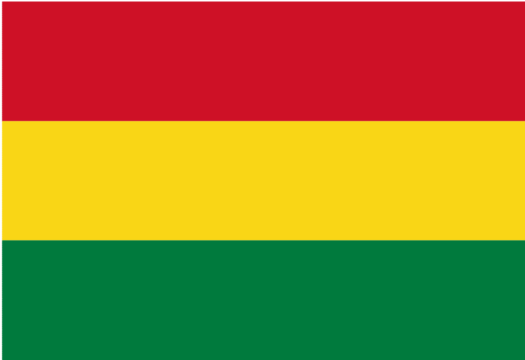
Figure 6.3 Bolivian flag.

Several flags have served as the national flag of Bolivia since its independence from Spain in 1825. This one has remained the national flag since it was adopted in 1851. The band of red represents the army, yellow the vast mineral resources, and green the fertility of land.