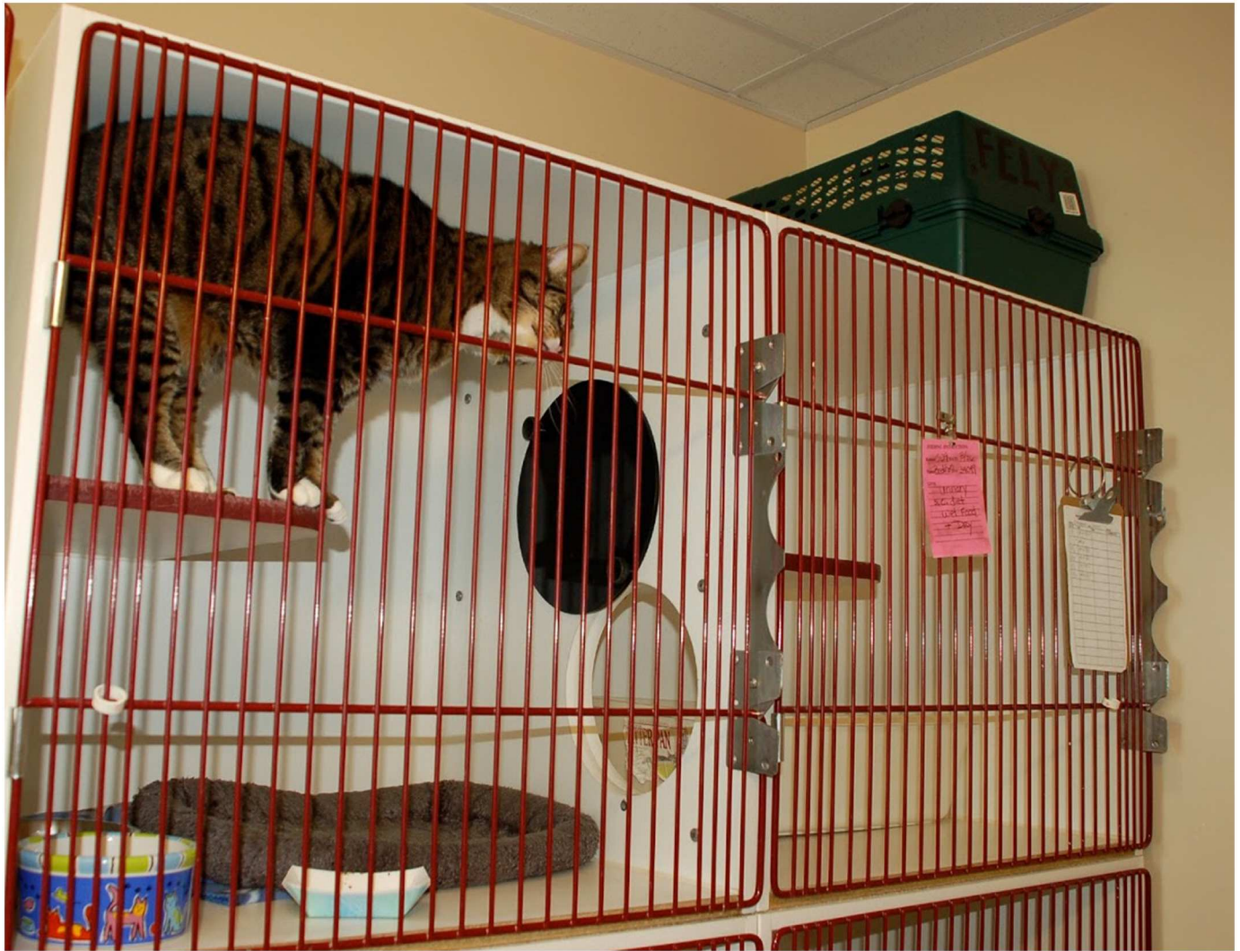
Fig 2. Feline housing \geq 8\text{--}10\text{ ft}^2 ( 0.74\text{--}0.93\text{m}^2 ) of floor space and double compartment.

https://doi.org/10.1371/journal.pone.0190140.g002