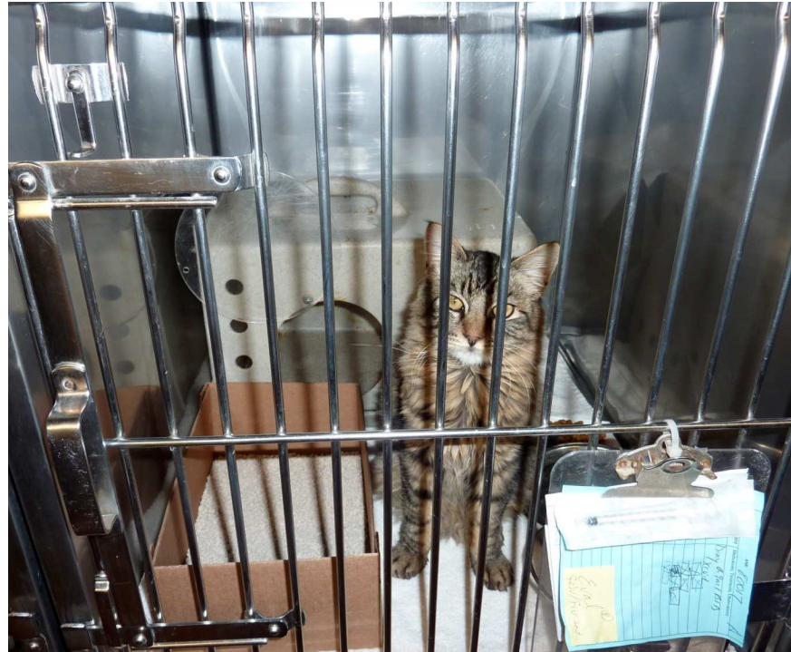
Fig 3. Single-cage housing unit 3-6ft 2 (0.28–0.56m 2 ) of floor space with solid hiding structure (feral den).

https://doi.org/10.1371/journal.pone.0190140.g003