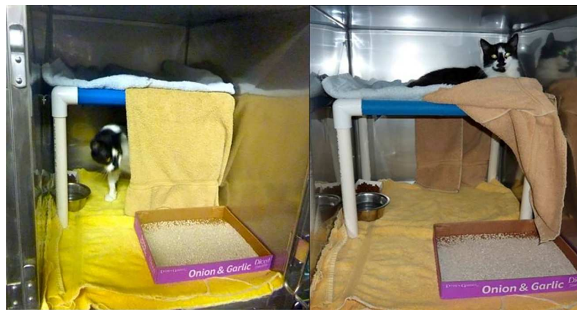
Fig 4. Single-cage housing unit 3-6ft 2 (0.28–0.56m 2 ) of floor space with a raised bed and a towel draped to provide hiding place with more usable floor space.

may be encountered soon after admission, as it can elicit more rapid immunity than subcutaneous vaccination and can elicit a local mucosal immune response. One study showed a modest reduction in URI risk when a modified live intranasal FHV-1/FCV vaccine was used in conjunction with an inactivated subcutaneous vaccine, compared to the inactivated subcutaneous vaccine alone[19]. Another showed no significant benefit when a modified live intranasal FHV-1/FCV vaccine was used in conjunction with a modified live subcutaneous vaccine[18]. In clinical trials, intranasal vaccination has been associated with mild clinical signs in up to 30% of vaccinates. It could be that vaccine reactions appeared clinically identical to URI and