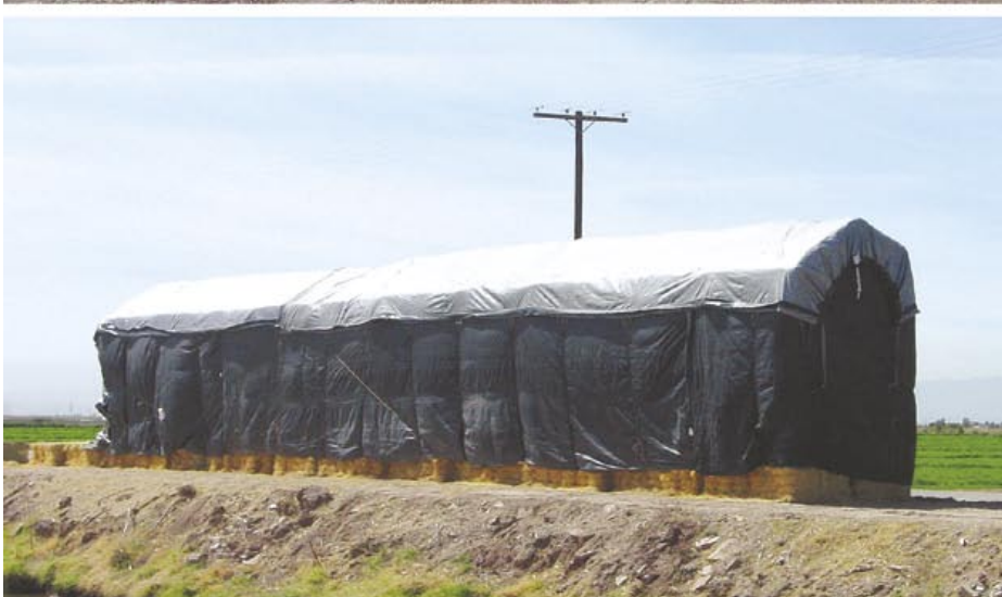
Top , alfalfa hay is normally stored unprotected along ditch banks in the Sonoran Desert; middle , hay can be stored outside but protected from rain and sunshine; bottom , tarped hay.

(nitrogen content of ADF as a fraction of total N) may be considered heat-damaged. In our experiment, ADIN/N increased significantly ( P < 0.05 ) under all treatments, suggesting the formation of Maillard products (table 1). After 11 weeks of hay storage in the irrigated Sonoran Desert, Guerrero and Winans (1999) had ADIN/N levels of 13%, 17% and 17% for similar storage treatments. The previous baled-hay storage trial was done during the summer of 1993, which was warmer than during our 1998 trial, with mean monthly maximum temperatures from June through October of 114°F, 113°F, 118°F, 112°F and 105°F, respectively.