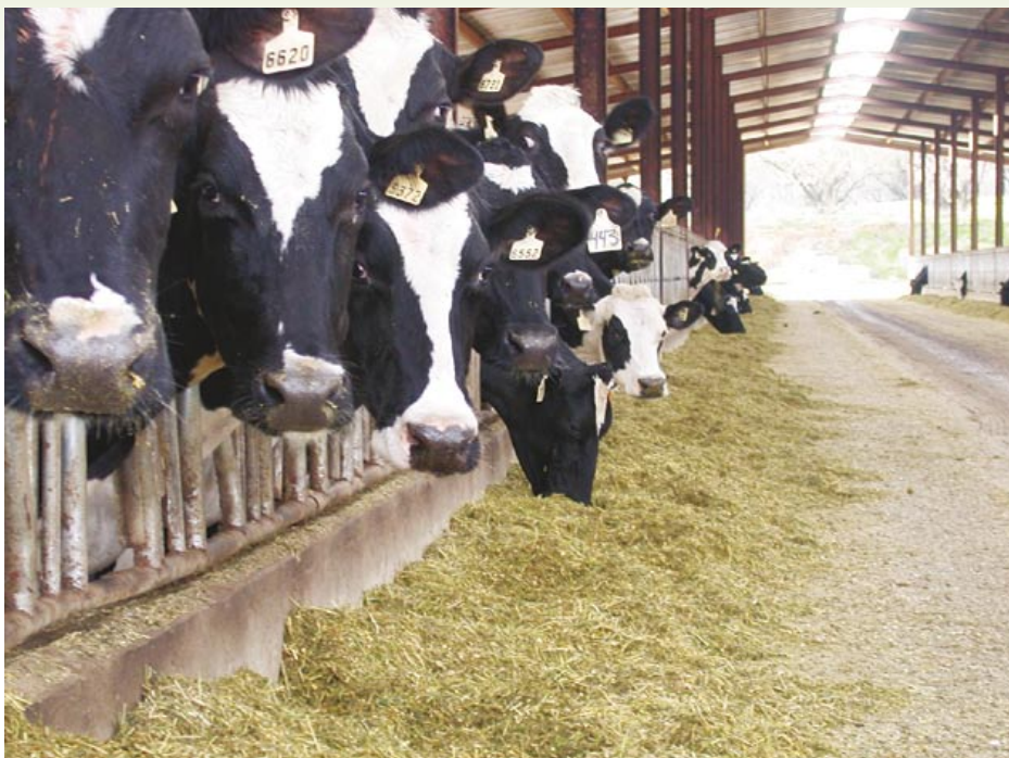
Alfalfa hay is a key ingredient in dairy cattle feed. Exposure to sun and heat can degrade the nutritional quality of hay and reduce its price.

Hay stored for prolonged periods of time decreases in value for feeding livestock. The irrigated Sonoran Desert of southeastern California and western Arizona is the hottest inhabited part of the United States, with summer temperatures routinely exceeding 100°F from May through October. We evaluated the effects of three methods of hay storage there during the summer: uncovered, under a roof and under a tarp. After 21 weeks, hay that was protected from summer solar radiation, either by the use of barn storage or plastic tarps, had more digestible content.