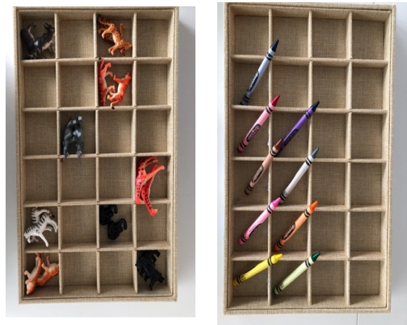
Figure 2: Sample stimuli. 3R/0E condition with animals and 5R/4E condition with crayons. The two functions of the constructions, and animals vs. crayons were separately counterbalanced across

After initial exposure, children were asked to label another item the way Mr. Chicken would. Then, children were exposed again in the same way to the same condition and were asked to label a different item. This provided two responses for each condition. In the 5/4 condition, children were asked to label two never-before-seen items. In the plural condition, children labeled one of the remaining 6 items they hadn’t heard labeled. Thus, children provided four critical responses, two in each condition.