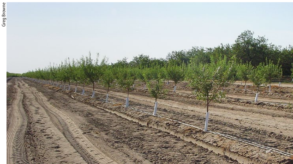
First-year impact of Prunus replant disease at the Madera replant trial; stunted trees in the foreground were planted in plot of nonfumigated replant soil, while larger trees in the background of the same row were in plot of preplant fumigated soil.

Across both trials, the strip treatments with Pic and combinations of 1,3-D:Pic (63:35 and 39:60) generally afforded greater net returns than other treatments. Although the GPS-controlled spot treatments generated lower net returns than some of the strip treatments, the spot treatments provided greater returns than the strip treatment with 1,3-D alone, which has been an almond and stone fruit industry standard. In terms of dollars of net revenue per pound of fumigant, the spot treatments were generally more efficient than strip or full-coverage treatments (table 1). When a net price of $1.70 per kernel pound was assumed (instead of $2 per pound, for the sake of comparison), all of the MB-alternative treatments