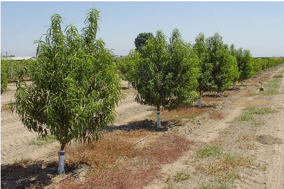
In the first growing season of the peach replant trial near Parlier, peach trees planted in preplant fumigated plots grew well ( above , shown are trees in plot strip treated by shank injection of 1,3-D:Pic 63:35), while the peach trees planted into nonfumigated control plots grew poorly due to the PRD complex, below .