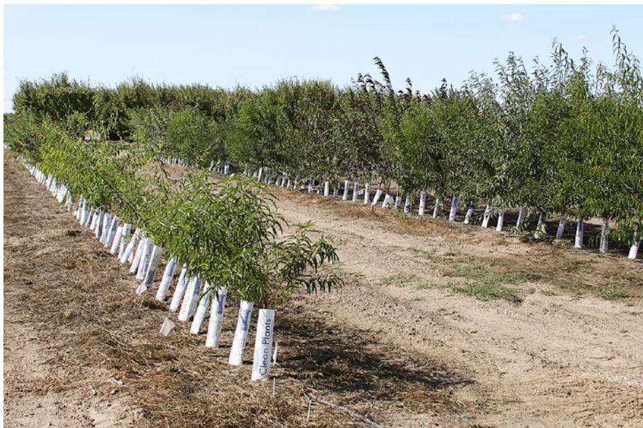
Rootstocks for almonds and stone fruits were tested for their resistance to the Prunus replant disease complex near Parlier, CA. Shown are a plot of PRD-affected rootstocks in nonfumigated replant soil, left, and a plot of relatively healthy rootstocks grown in soil preplant fumigated with 1,3-D:Pic 63:65 (Telone C35), right.

Approximately 1 million acres of California's best agricultural land are devoted to production of almonds and stone fruits (USDA 2011), and sustained high production from this land requires that the orchards be replanted every 15 to 25 years, depending on the production