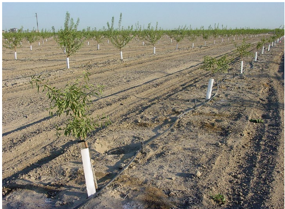
First-year impact of Prunus replant disease at the Firebaugh replant trial; stunted trees in the foreground row were planted in plot of nonfumigated replant soil, while trees in the background rows were planted in preplant fumigated soil.

In each orchard, all preplant soil fumigation treatments were applied by TriCal Inc. (Hollister, CA) to plots that would accommodate a width of three tree rows (66 feet) and a length of 10 tree spaces (140 to 170 feet). The MB treatments were applied with a conventional MB rig (TriCal Inc.), and the system injected fumigant at soil depths of 18 to 20 inches through two shanks spaced 60 inches apart; one pass was made for each tree row, effectively treating a 10-foot-wide strip. The other fumigant treatments were applied with a Telone rig (TriCal Inc.), which also injected fumigants at soil depths of 18 to 20 inches, but through three or five shanks (depending on the treatment). The shanks were spaced 20 inches apart and tipped with horizontal “wing” attachments. Fumigant was released from two points 8 inches apart, one behind each wing tip. The rig was used to apply three types of treatments: single-pass strip treatments, in which fumigant was