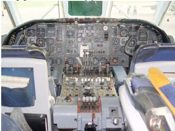
Fig. 2 Forward cockpit of VC—10 aircraft

The aviation checklist, the first version of standard procedures in aviation, was invented in 1935 when the US Army was testing Boeing’s prototype four engine bomber, which later became the B-17. On a test flight with the Air Corps’ chief test pilot at the controls it took off, rose to 300 feet, stalled, crashed, and burned. “Investigators determined that the Fortress had crashed because the elevator and rudder controls were locked—the pilot could not lower the nose, so the aircraft quickly stalled. Ironically, the elevator locks had only been recently installed as a safety feature, to protect the control surfaces from moving about on the ground and being damaged during high winds. The locking mechanism was controlled from inside the cockpit, but no one remembered to disengage it before takeoff [7].”