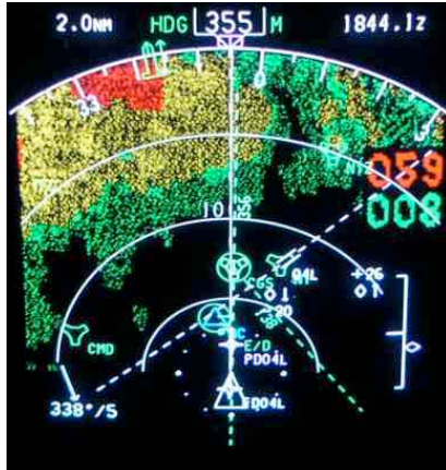
Fig. 5 Sample terrain display from enhanced warning system [14]

But contemporary systems also provide an entirely new level of warning, called “Enhanced” Ground Proximity Warning System. In essence these systems contain a 3-dimensional model of the world which they use as a “virtual radar” that looks ahead of the aircraft and warn of approaching problems far before any on-board sensor could detect them. Furthermore, they show a continuous real-time contour map of approaching terrain, with color codes to indicate terrain at different altitudes. (Fig. 5) The map also shows pilots how to take evasive action.