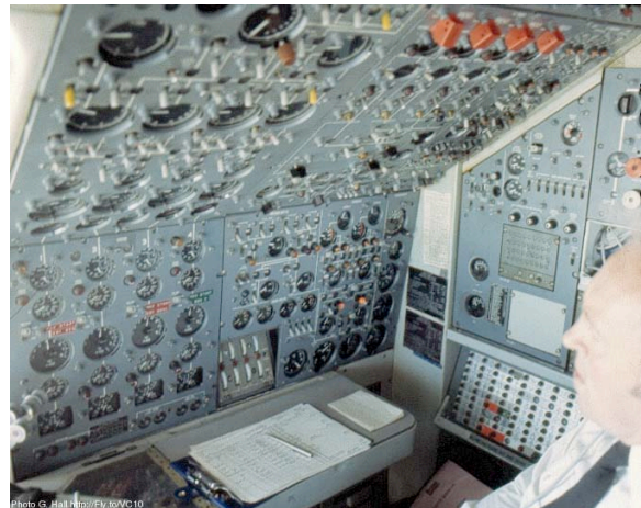
Fig. 3 Flight Engineer on VC-10 commercial jet

Even with procedures, piloting was limited by the processing ability of the human mind and the speed of the human nervous system. As the number of instruments and controls increased, one approach was to add more crew, in some cases up to five specialists: pilot, copilot, engineer, navigator, and radio operator. (Fig. 3) Adding crew to planes increased weight and cost and reduced performance. Furthermore, rising speeds required faster reaction times than people could provide consistently.