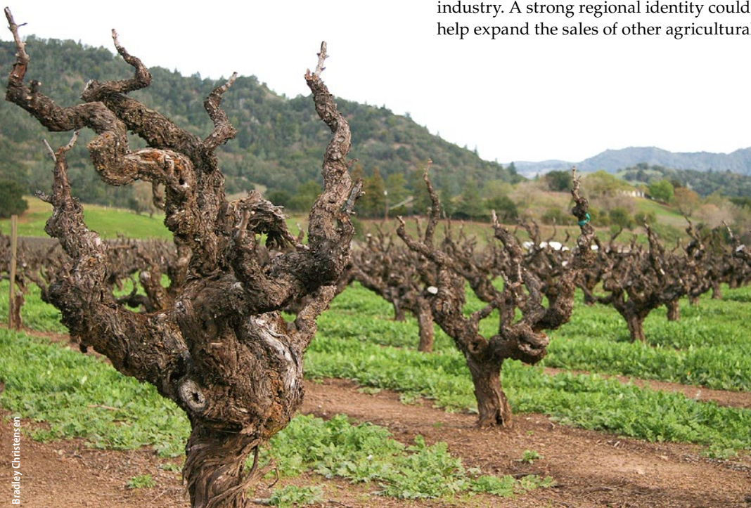
An Alexander Valley vineyard near Healdsburg in Sonoma County.

Organic products. Often mentioned is the possibility of developing regional identity on the basis of organic production, but most regions produce a large