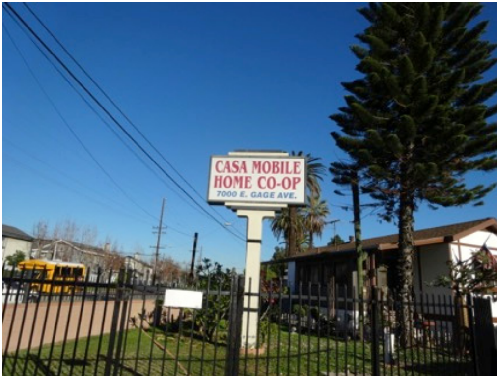
Figure 3. Casa Mobile Home Co-op, Bell Gardens, CA.

In southeast Los Angeles County, the recent Exide battery plant scandal has underlined the mutual dependence and social coherence of the area and highlighted the ills created by political fragmentation. With the adoption of thoughtful constitutional and statutory amendments and the efforts of community leaders, hopefully the political unification of this community and others like it can be achieved. 170