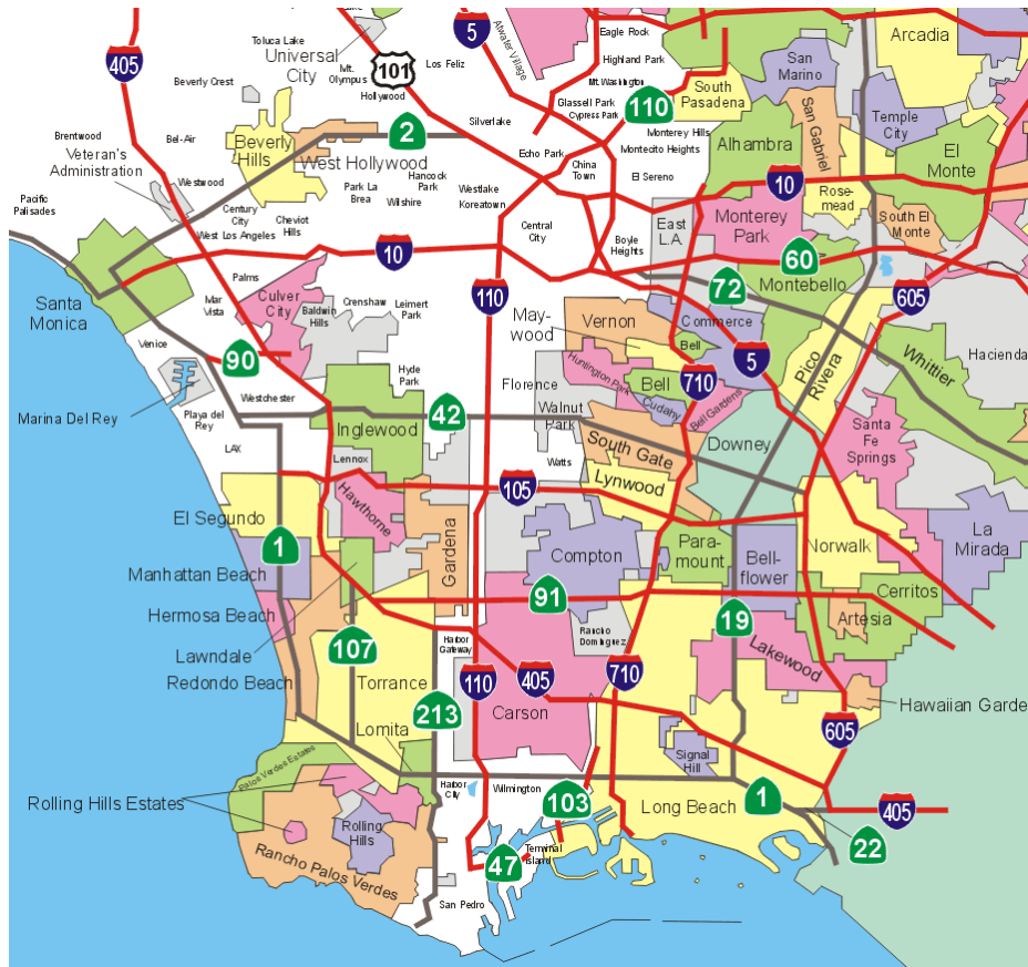
Figure 1. Map of Southern Los Angeles County (with color coded municipalities and unincorporated areas)

Vernon and its neighbors lie just above the center point of the map.