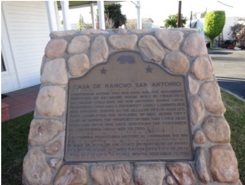
Figure 5. Front Entrance to Gage Mansion, Built Atop the Casa San Antonio, Bell Gardens, CA.