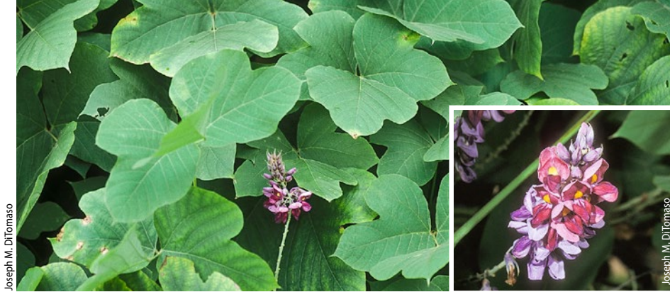
After being introduced as an animal forage species, kudzu ( Pueraria montana ) escaped to invade forested areas in the southern United States. Kudzu is neither naturalized nor sold in California.

a major agricultural sector in California, accounting for $2.5 billion in sales in 2011 (CDFA 2012).