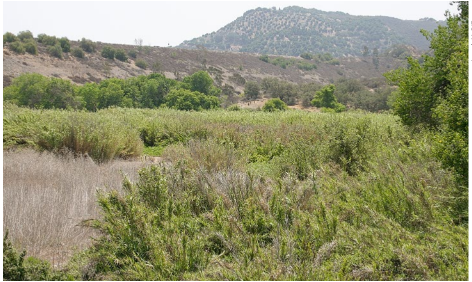
Joseph M. DiTomaso

Plants have been transported around the world for centuries, as agricultural commodities, ornamental species or inadvertent contaminants of imported materials. Naturalized plants are those that have spread out of cultivated areas, including gardens, into more wild areas, and invasive plants are the subset of naturalized species that cause ecological or economic harm. In general, only a small proportion of plants introduced into a new region have been invasive plants. However, the number of invasive plants with horticultural origin is high, making it critically important to natural resource managers, ecologists and policymakers to predict which newly introduced species pose the greatest risk of escape and invasion.