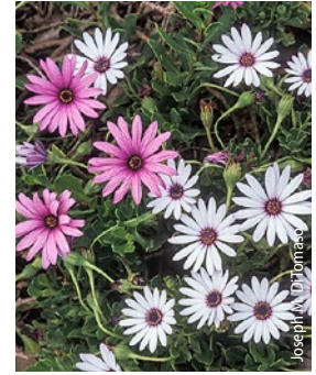
Species introduced as ornamentals or forage species that have escaped cultivation in California include, left, Mexican daisy ( Erigeron karvinskianus ), Japanese honeysuckle ( Lonicera japonica ), buffelgrass ( Pennisetum ciliare ) and African daisy ( Osteospermum ecklonis ). While these species are not yet major problems in the state, some have become more serious invasive plants in other regions of the country.

full prescreening risk assessment before introduction to the state. Plants that are not naturalized in California but that are sold here (table 2) should be reviewed by the nursery industry to reduce their sale and also watched for any spread into wildlands. In addition, noninvasive ornamentals that serve the same purpose in a landscape (same plant shape, same color flowers, etc.) should be promoted as alternative options. Species that are naturalized but not yet sold in California (table 3) should be restricted from sale, and land managers should watch for their further spread. Finally, species that are both naturalized and also sold in California (table 4) may be considered for removal from the