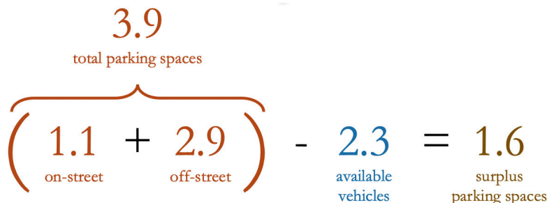
Figure 1. Average parking supply and surplus estimated for Sacramento’s single-family detached homes

Therefore, the average single-family home in Sacramento could add an ADU and still have at least 0.6 surplus parking spaces, even when all vehicles from both the primary home and ADU were parked at home at the same time.