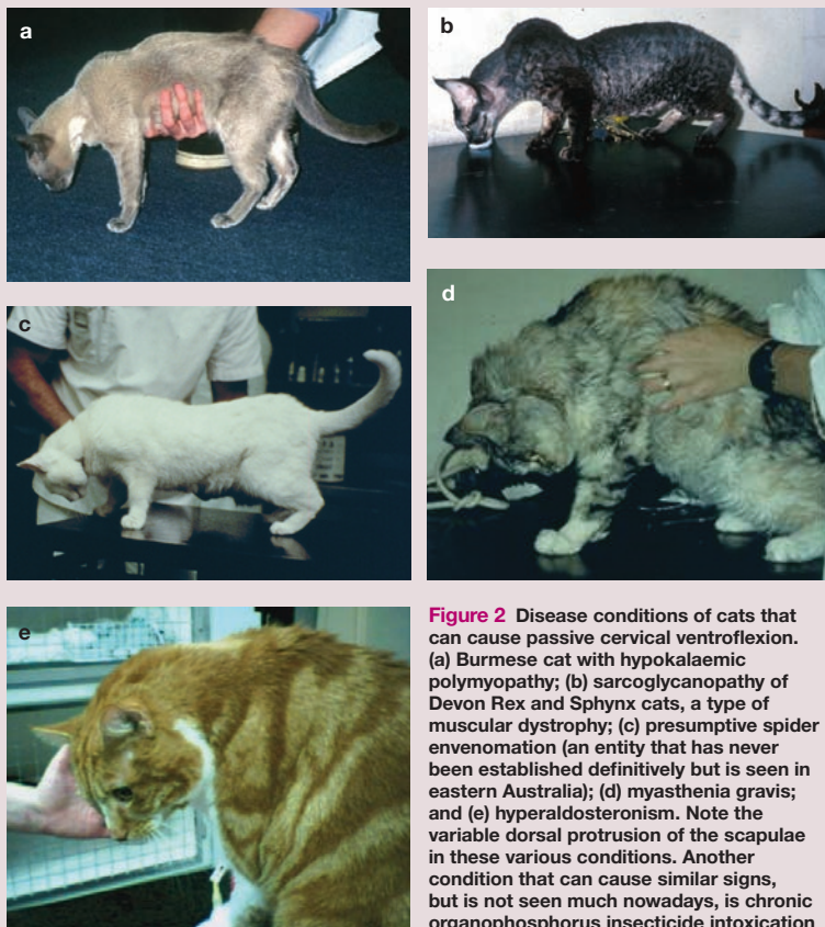
Figure 2 Disease conditions of cats that can cause passive cervical ventroflexion. (a) Burmese cat with hypokalaemic polymyopathy; (b) sarcoglycanopathy of Devon Rex and Sphynx cats, a type of muscular dystrophy; (c) presumptive spider envenomation (an entity that has never been established definitively but is seen in eastern Australia); (d) myasthenia gravis; and (e) hyperaldosteronism. Note the variable dorsal protrusion of the scapulae in these various conditions. Another condition that can cause similar signs, but is not seen much nowadays, is chronic organophosphorus insecticide intoxication