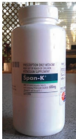
Figure 3 The potassium chloride formulation the authors recommend for treating hypokalaemic Burmese cats. Most cats require half a tablet given immediately before each meal. This formulation is inexpensive and readily available