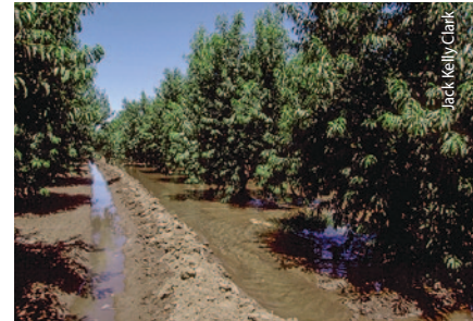
UC scientists are developing methods to reduce nitrate levels in irrigation runoff in order to farm more efficiently and protect drinking water in rural areas.