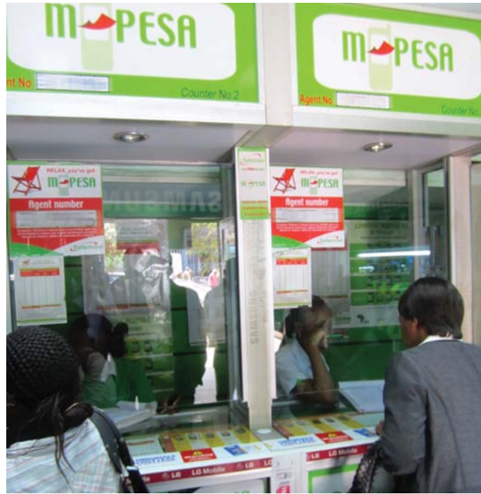
M-Pesa Kiosk in Nairobi

ple exchanging small sums of money needed a central record keeper and accounting system, usually being done by hand. Microfinance donor agencies and technology companies interested in microfinance to impact their own double bottom line saw in the mobile phone a promising solution to facilitate both transfers of money and the back-end accounting and processing of these numerous transactions. It is important to remember that these devices, like the old Nokia mobile phones, had very basic features that in the age of smartphone proliferation seem exceptionally simple. At the time, however, trading cash for electronic value solved many problems all at once, from cash handling to transportation. The risk of theft and the accounting problem were both taken care of by the mobile network operator that could track all the transactions. Mobile money also did not require heavy investment in infrastructure because cell towers could be set up in the countryside and could run on generators rather than being wired into an electricity grid.