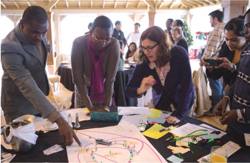
IMTFI researchers mapping mobile money social networks at the 2014 conference workshop

research suggests that insights like these can only come from engaged, qualitative research with the populations for whom such services are intended.