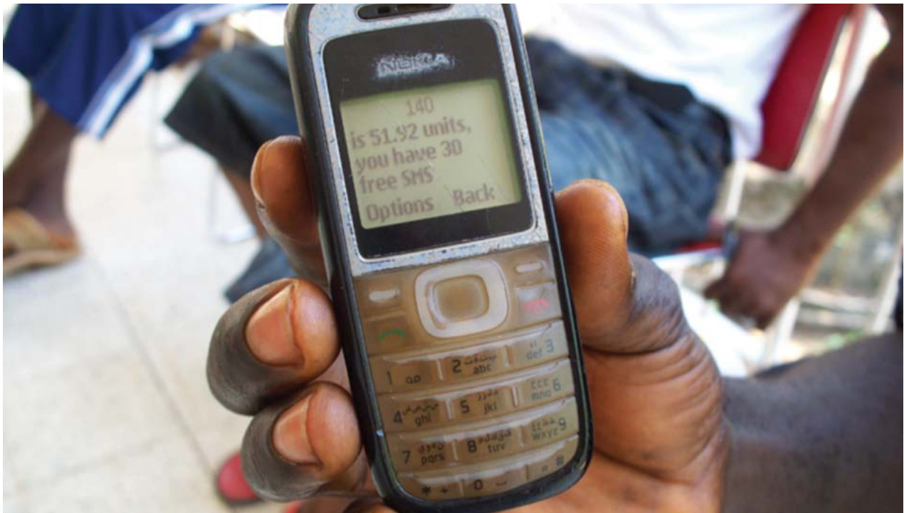
Mobile Phone with SMS credit in Sierra Leone

and technological change. IMTFI funds original research on cultures of money around the world, and it serves as a clearinghouse for research on the emerging mobile money phenomenon, as well as an archive of people's everyday socio-economic, ritual, and religious engagements with money. It issues an annual call for proposals and invites researchers from around the world to apply for small grants to support projects of 9-12 months in duration. Proposals are reviewed by a team of academics and industry experts. The process is competitive—last year, only 11% of the 192 proposals received were funded. IMTFI uses this process to find researchers interested in money, mobile and technology, who can then contribute to the worldwide discussions about mobile money and financial inclusion.