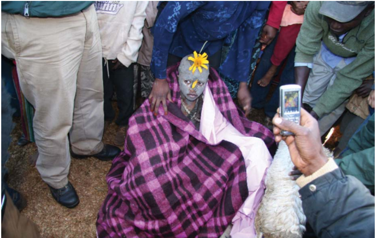
Coming of Age Ceremony in Kenya