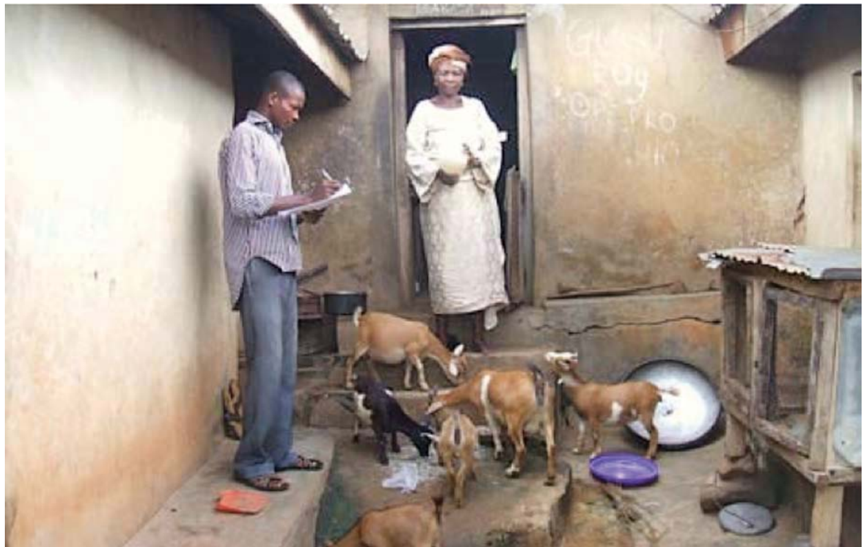
Small ruminants as sources of financial security in Nigeria

as Susu savings operations in Ghana (Osei-Assibey 2014); as well as how mobile money facilitates and extends njangi sociality and social solidarity in Cameroon (Nyamnjoh and Fuh 2014). Trust in different instruments in a monetary ecology is also a critical site of inquiry and is embedded in deep contextual histories. People in many countries of the global South have in their own or their parents' lifetimes experienced profound economic shocks, political crisis, violence and displacement, and the failure of institutions. These histories help account for why, for instance, banks may be more trusted in some countries than others. Insights from IMTFI researchers also show that people prefer to store value in gold or buy land or plant trees as more stable long term investments or in small animals or ruminants (Oluwatayo & Oluwatayo 2012).