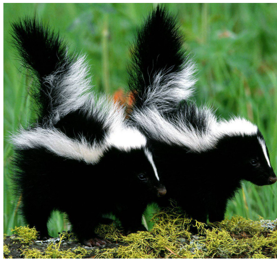
Striped Skunk Mephitis mephitis

I am an omnivore. I eat seeds, grasses, pickleweed, and insects.