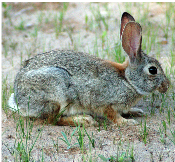
Brush Rabbit Sylvilagus bachmani

I have woolly, bristly, tan and brownish flowers.