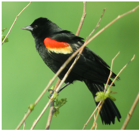
Red-winged Blackbird Agelaius phoeniceus

I am a carnivore. I primarily feed on small mammals.