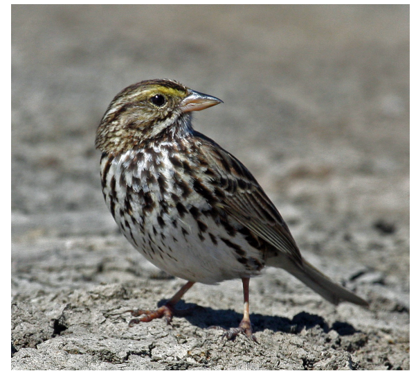
Belding's Savannah Sparrow Passerculus sandwichensis beldingi

I am an omnivore. I primarily eat seeds, but I also eat insects.