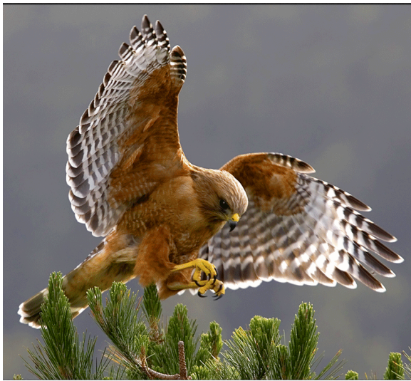
Red-shouldered Hawk Buteo lineatus