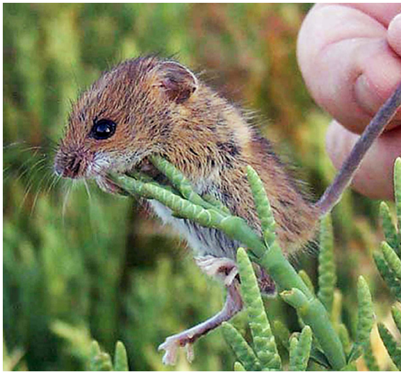
Saltmarsh Harvest Mouse Reithrodontomys raviventris