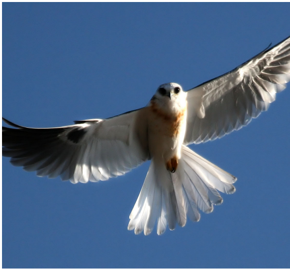
White-tailed Kite Elanus leucurus