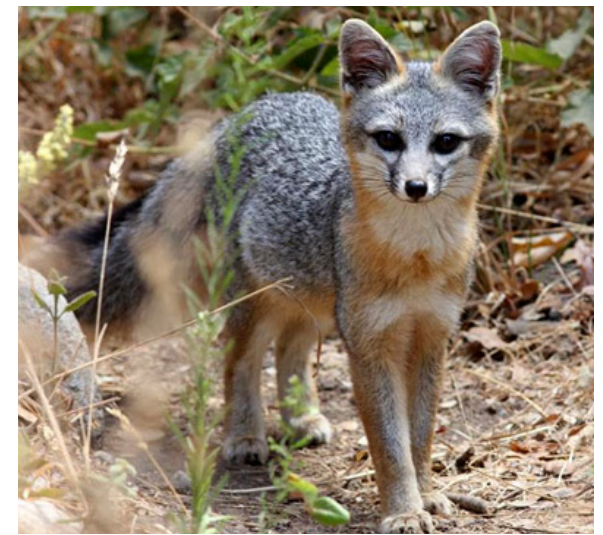
Gray Fox Urocyon cinereoargenteus