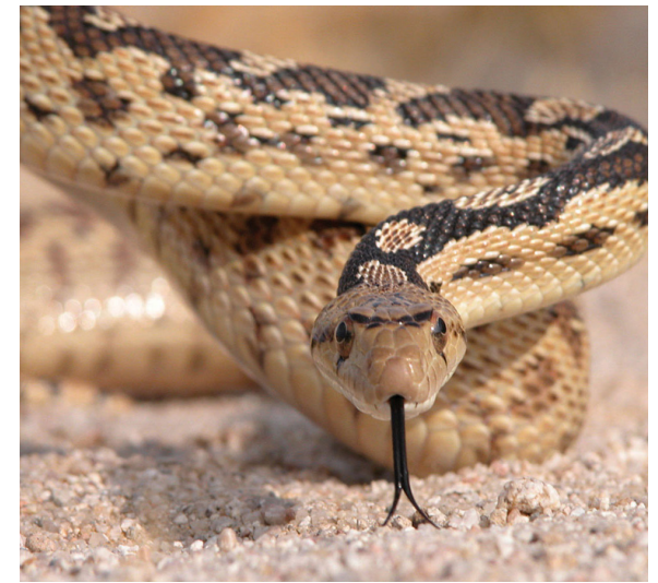
Gopher Snake Pituophis catenifer