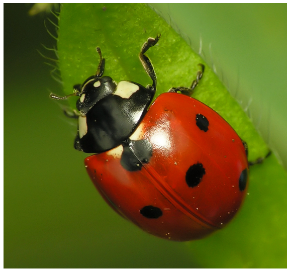
Ladybug Coccinella septempunctata