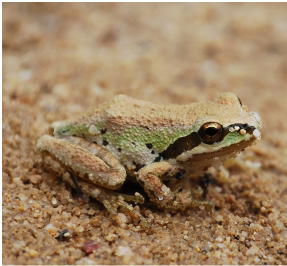
Pacific Tree Frog Pseudacris regilla