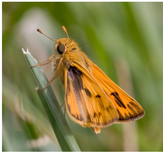
Skipper Butterfly Hylephila phyleus