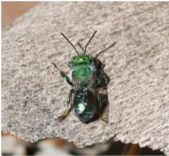
"Native Bee" Osmia lignaria