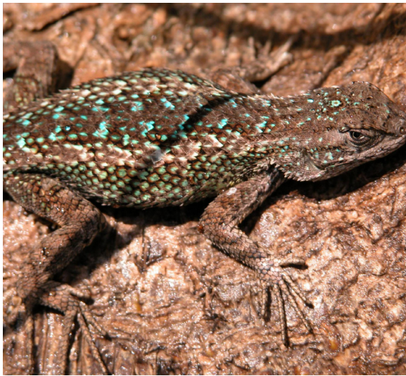
Western Fence Lizard Sceloporus occidentalis