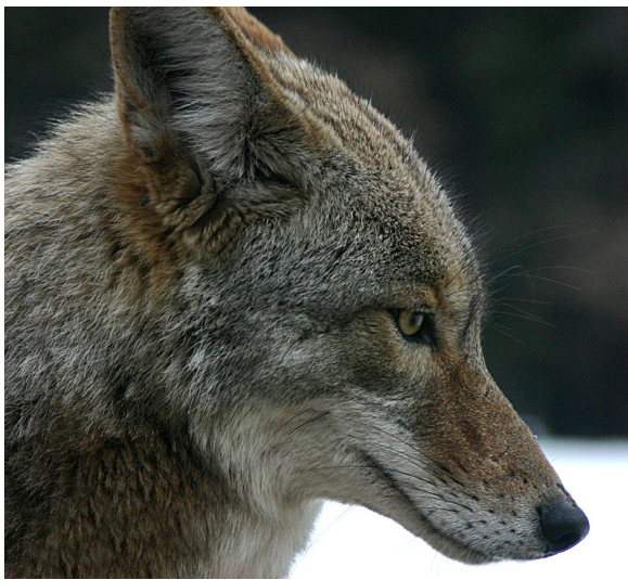
Coyote Canis latrans

I am an herbivore. I eat grasses and many other herbaceous flowering plants such as the California sunflower, milkweed, and clovers.