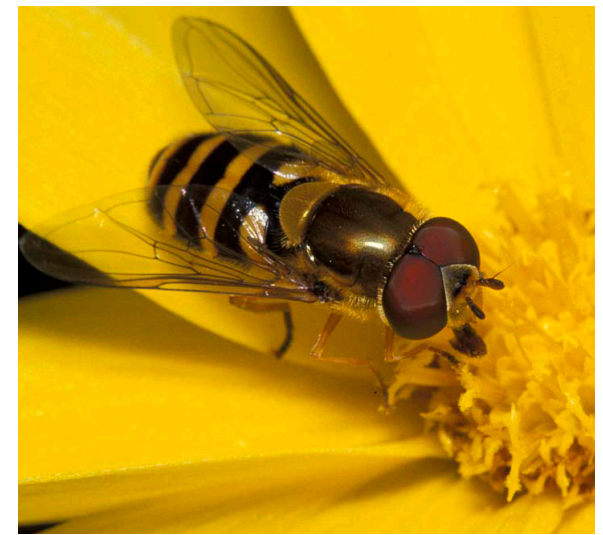
Hoverfly Simosyrphus grandicornis

I am an omnivore. I eat aphids and other small insects.