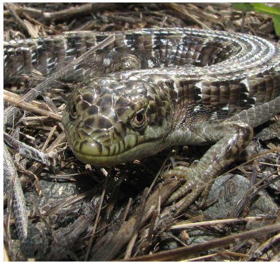
Southern Alligator Lizard Elgaria multicarinata

I am a carnivore. I eat insects and spiders.