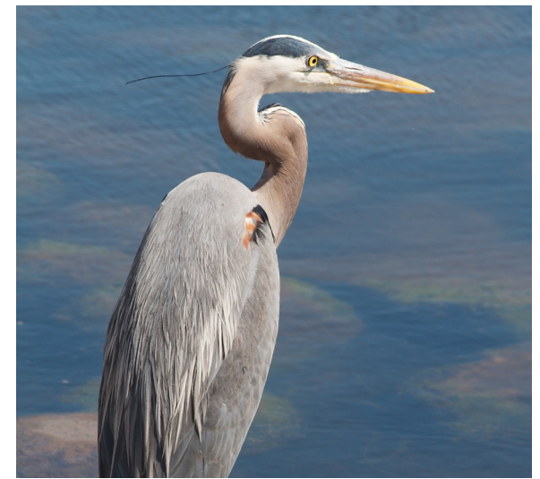
Great Blue Heron Ardea herodias

I am a scavenger. I primarily feed on carrion.