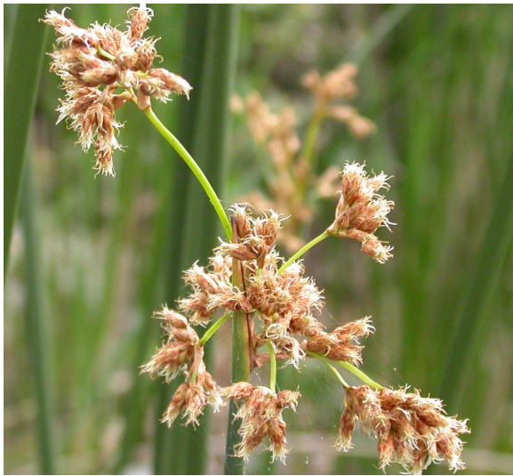
California Bulrush Schoenoplectus californicus