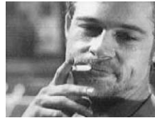
Julia Roberts and Brad Pitt have influenced young audiences to smoke in at least four movies each. Will their most lasting legacy be hundreds of thousands of deaths? Or a principled refusal to do Big Tobacco's dirty work?

Over the next twelve months, the tobacco industry will kill more women and men in the U.S. than AIDS, drunk driving, illegal drugs, homicide and suicide combined.