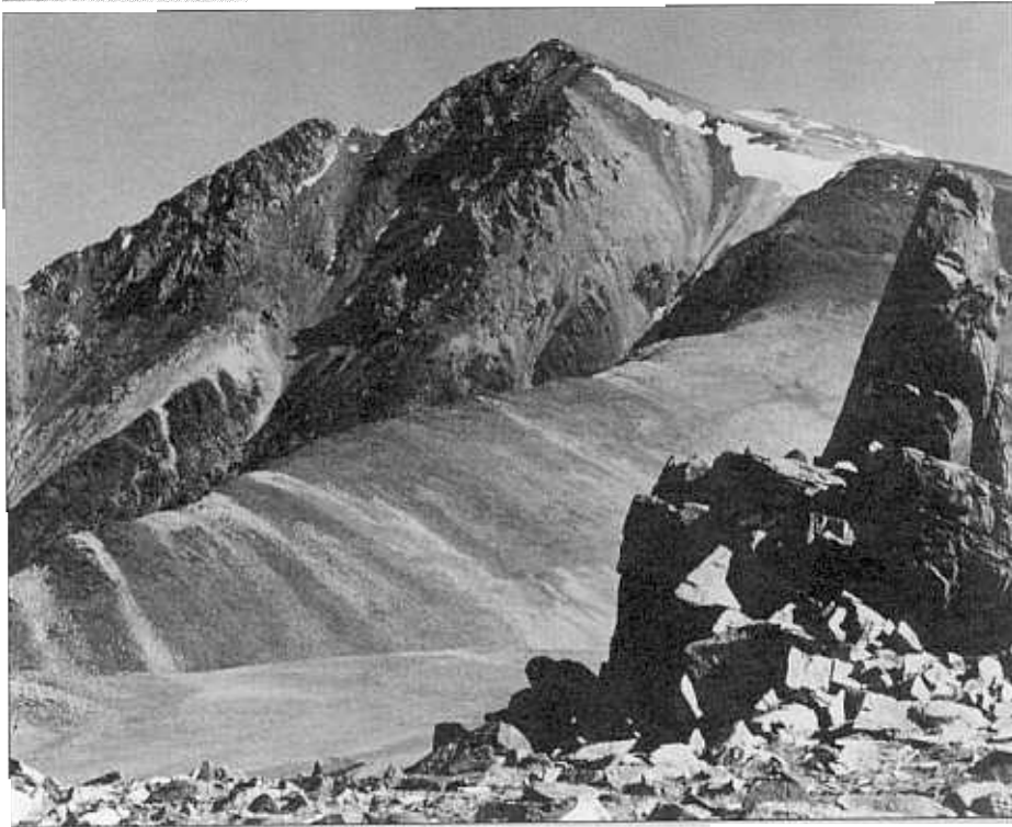
White Mountain Peak from South (6-UC-5-2)

The Missouri Botanical Garden serves as the organizational center for the FNA project, which publishes a quarterly newsletter to communicate news about the project. For more information, contact: FNA Newsletter, P.O. Box 299, St. Louis, MO 63166; (314) 577-5180.