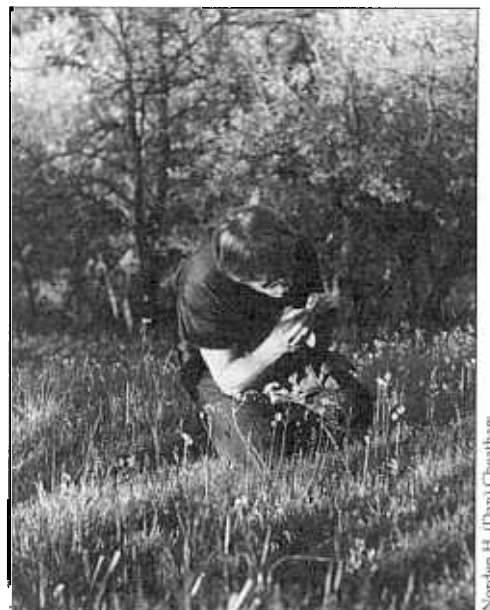
Student researcher examines Hastings flora.