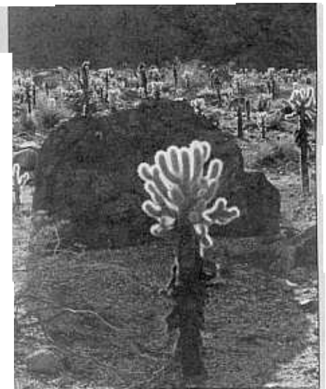
Cholla, Deep Canyon

Accompanying the UC photos are 75 Adams classics owned by Pacific Telesis Group. Both exhibits have been funded by a $190,000 grant from Pacific Telesis.