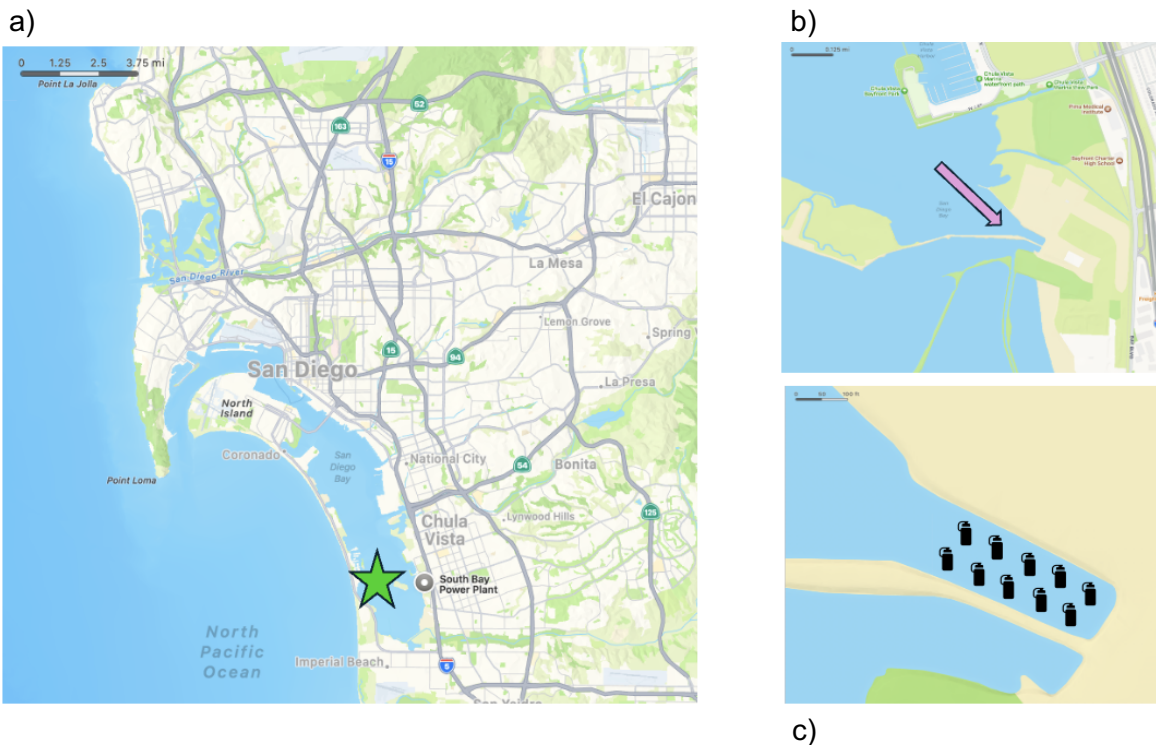
Figure 1 | a) the South Bay Power Plant located in South San Diego Bay remains a popular location for C. mydas year round b) the intake channel is the primary location for the turtles and the study site for this project c) samples were collected in a distributed pattern to get a snapshot of the area on each given sampling day.

day in April, and 3 consecutive collecting days in May, for a total of 59 samples. Once the site was reached, researchers spent at least 1 hour surveying the area for turtle heads and kept a record of the number and location of each sighting. Additionally, drones collected aerial survey data when possible to contribute to an accurate count of how many turtles were within the intake channel. Group size estimations ranged from 3-8 individuals. For the water samples, all equipment was disinfected with 10% bleach for 10 minutes, rinsed with deionized water, and dried in a clean room prior to use. Samples were collected in 1 L or 2 L amber bottles (Thermo Scientific) in a distributed pattern to get a true snapshot of the area on 3 of the 4 field days, and right next to individual C. mydas captured for further analysis on 1 of the 4 field days. All samples were collected at the air/surface interface (~0.5 m depth) by hand. For each field effort, a field control was filled with 1 L MilliQ deionised water in the lab, and kept on ice in the cooler with the other collected samples while out at the site to monitor for potential contamination. All samples were kept in the cooler with ice packs until getting back to the laboratory at Southwest Fisheries Science Center (SWFSC), La Jolla. All samples were vacuum filtered immediately after collection (within 5 hours).