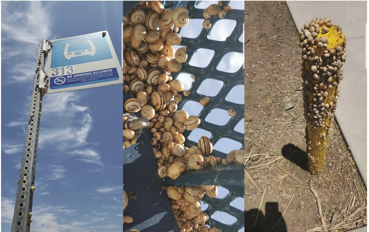
Fig 1. Left to right: Theba pisana aestivating on a bus stop sign; beneath a bus stop steel bench and on a yellow pole near a sidewalk in Oceanside, CA.

https://doi.org/10.1371/journal.pone.0228244.g001