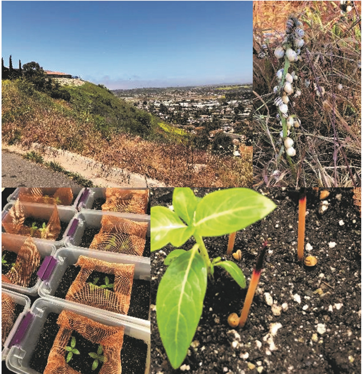
Fig 2. Clockwise from top left: The collection site of Theba pisana in a vacant lot in Oceanside, San Diego (33° 12'35" N 117° 20'30" W); snails on the vegetation; treatment arenas; and dead snails 7 days after treatment.

https://doi.org/10.1371/journal.pone.0228244.g002