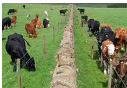
Figure 2. BLV positive and negative cattle separated by two fences.