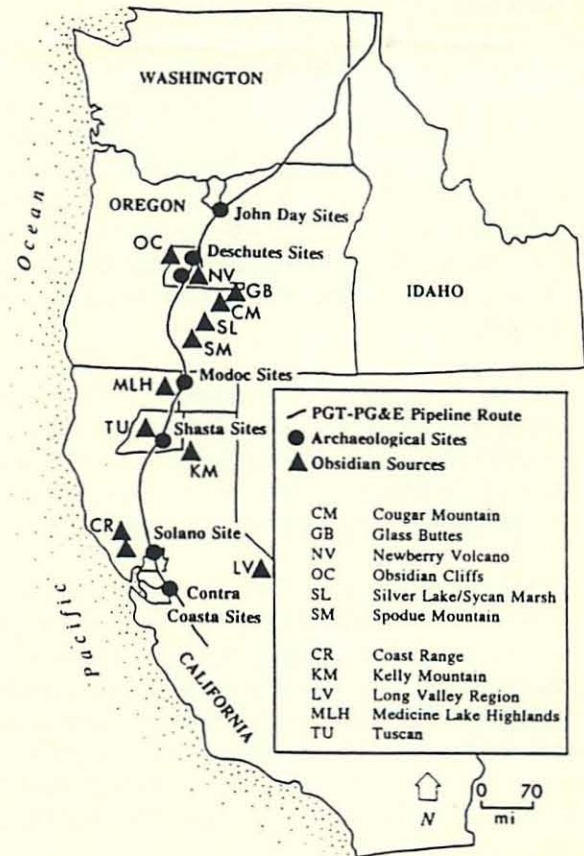
Figure 1. Map of the PGT-PG&E Pipeline Expansion Project, major obsidian sources, and obsidian-related archaeological site locations.

Since 1988, INFOTEC Research, Inc. (IRI) has been the prime contractor for cultural resource studies associated with the Pacific Gas and Electric (PG&E) and Pacific Gas Transmission Company (PGT) Pipeline Expansion Project (PEP). This project, one of the largest pipeline projects in recent years, involves the construction of 845 miles of natural gas pipeline along a transect extending from Alberta, Canada, to Fresno County, California (Figure 1). Much of the project parallels an already existing natural gas pipeline dating to the 1960's.