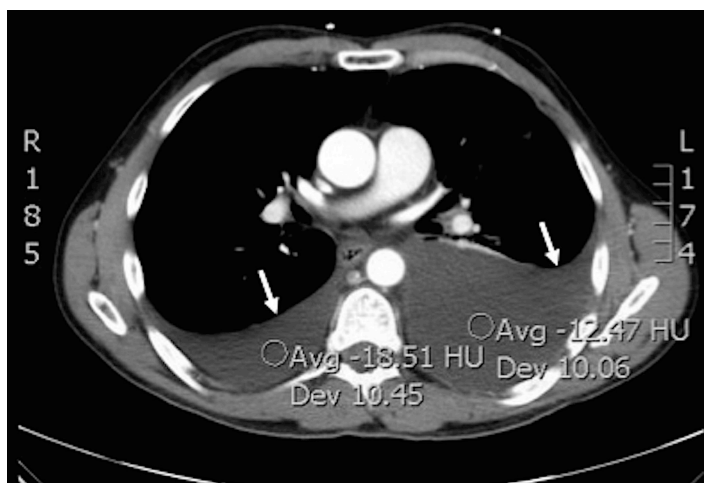
Image 2. Computed tomography of the chest with contrast showing bilateral pleural effusions more remarkable on the left side (white arrows).

On examination, the patient appeared in obvious discomfort. Vital signs revealed a respiratory rate of 20 breaths/minute, heart rate of 65 beats/minute and blood pressure of 126/90, with an oxygen saturation of 92% on room air. Chest examination revealed diminished breath sounds on the middle and lower left lung zones. There was no chest wall tenderness, rhonchi or rales. Examination of other body systems was unremarkable. Plain chest radiograph demonstrated obliteration of the left costophrenic angle (Image 1a). Computed tomography (CT) of the chest with contrast revealed moderate to large left pleural effusion and small to moderate right pleural effusion with no evidence of pneumothorax, rib or vertebral fractures (Image 2). The patient was admitted to the hospital with bilateral pleural