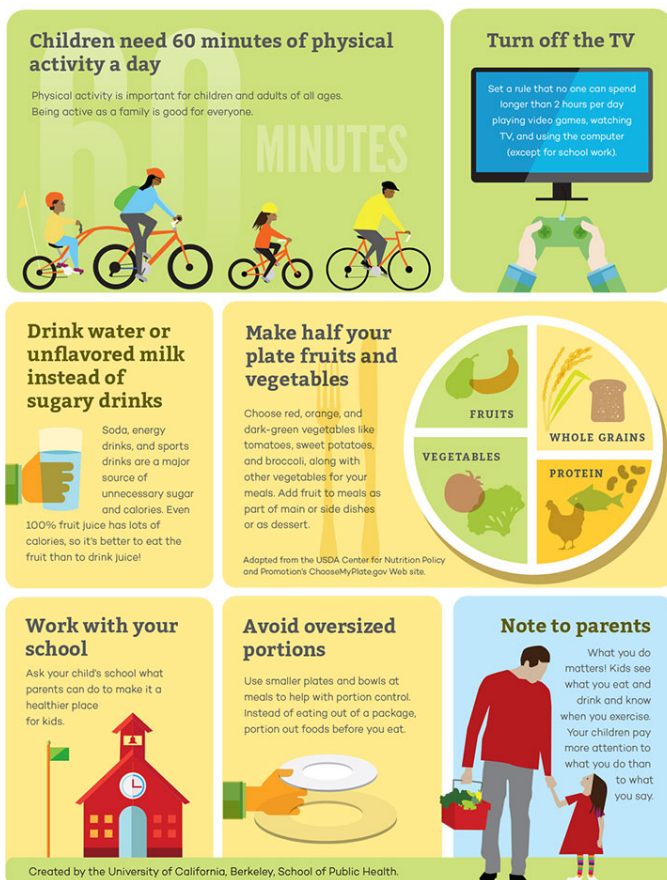
Figure 2. BMI Report (back side of the report).