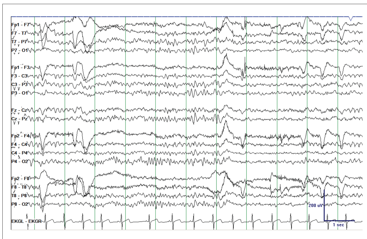
Figure 2. Repeat electroencephalography 7 days after presentation demonstrating normalization of the background.

adolescent. In this case, we suspect the patient's interictal discharges may have reflected a transient state of increased epileptogenicity following THC concentrate use, and that her diffuse background slowing was a related nonspecific finding reflective of her initial encephalopathy after frequent THC use and during the postictal period. Notably, these findings completely resolved on a repeat study with no interim antiseizure medication administration. The patient had no further seizures during her hospitalization, further supporting the theory that the initial clinical seizure(s) and EEG abnormalities were provoked by THC use. As with spice use, the mechanism of this epileptogenicity is not fully understood, although we surmise it could be related to THC's partial agonism of the CB 1 receptor. Further, high-dose THC may lower the seizure threshold by decreasing GABA transmission, as has been previously proposed [8]. It is also possible that the patient may have had an underlying seizure tendency, although no historical risk factors suggested this. If the tendency existed, it may still imply that use of the THC concentrate lowered the patient's seizure threshold.