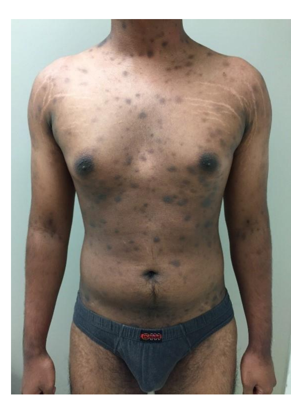
Figure 1 . Multiple brownish macules and thin plaques on the anterior trunk and proximal upper limbs. Note the lack of acanthosis nigricans on the neck, as well as extensive striae alba at the shoulder region from the pubertal growth spurt.

A 19 year-old man with Fitzpatrick skin type V presented to our clinic with multiple round dark brown macules and thin plaques over his face and body (Figure 1). Closer examination of the plaques revealed a velvety surface reminiscent of acanthosis nigricans (Figure 2). Darier sign was absent. These lesions gradually appeared over 6 months. The plaques were neither itchy nor tender and were not preceded by erythema and induration. He did not have acanthosis nigricans involving the skin folds. He was otherwise healthy and did not report any intake of oral medications or supplements and he had not applied any topical medicaments prior to the onset of his eruption. He did not recall his family members having a similar eruption. Histopathology from lesional skin revealed basketweave orthokeratosis, irregular acanthosis, and basal keratinocyte hyperpigmentation with a mild perivascular lymphocytic infiltrate in the upper dermis (Figure 3). His fasting glucose and lipid panel tests were normal. His clinical presentation was suggestive of idiopathic eruptive macular pigmentation with papillomatosis (IEMPP), although the histology did not show papillomatosis. Close monitoring over the next 1 year did not reveal any worsening or development of new lesions. The existing lesions remained unchanged.