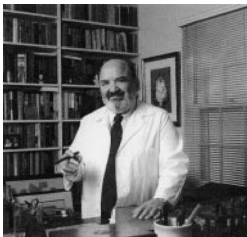
Figure 2 The author (a psychiatrist) of an opinion piece in Cigar Aficionado about the health risks of cigars entitled "Just the facts: a doctor examines the links between coronas and coronaries". 30

(fig 2)) at no point were any qualifications as an expert in tobacco related disease described.