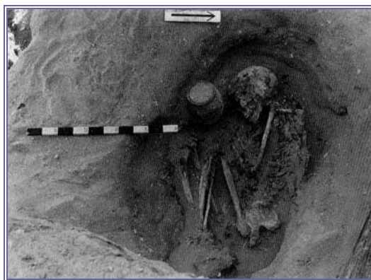
Figure 4. Maadi, burial number 44 (c. 3900 – 3600 BCE).

recorded from the cemetery is attested in the settlement, only certain forms from the settlement were deemed to be appropriate in a funeral context (Buclez 1998: 86). Comparison of the types of flints found in settlement and burial contexts also reveals preferential selection for blades, bladelets, and knives for use in mortuary arenas (Holmes 1989: 333). Palettes may also have been used differently in funeral contexts in comparison to everyday life, with green malachite staining predominant in burial contexts but red ochre more common on settlement palettes (Baduel 2008).