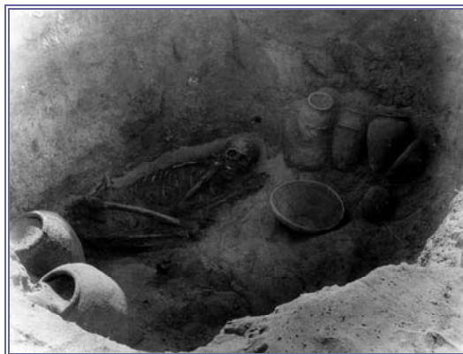
Figure 3. Naqada II burial (c. Naqada IID). El-Abadiya (Diospolis Parva), grave B379.

Such choice in funeral arrangements is also clear from the objects selected for inclusion in the tomb. It was previously assumed that some objects were made specifically for mortuary consumption, such as decorated pottery (D-ware). Examination of use-wear and settlement deposits has demonstrated, however, that this is not the case (Buclez 1998) and that the majority of tomb paraphernalia derived from daily life. Nevertheless, with the benefit of concurrent excavation of cemeteries and settlement at Adaima, it is evident that whilst all the pottery