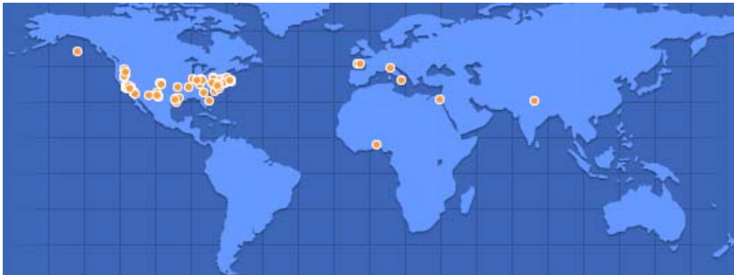
Figure 1: Geographic origin of survey responses

Over a one-week period after which the survey was closed, 156 responses were submitted anonymously by survey recipients from North America, Asia, Europe and Africa (Figure 1).