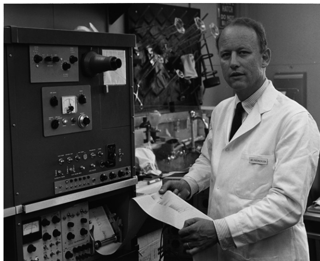
Fig. 5. Donald S. Fredrickson.

Heterogeneity of the A proteins, now designated apoA-I and apoA-II, was also shown at about the same time, with Angelo Scanu characterizing and defining physicochemical and biological properties of various HDL fractions (36), and Bernard and Virgie Shore ( Fig. 6 ), among others, contributing to this work through analysis of the C-terminal