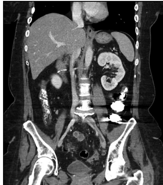
Fig. 1. DVT of the iliac vein. A large filling defect is shown within the left common iliac vein and left external iliac vein, compatible with DVT. An intraluminal filling defect is also noted within the superior mesenteric vein, also compatible with DVT.