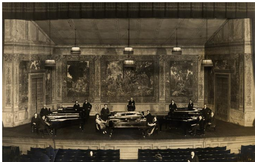
Moszkowski Testimonial Concert, December 21, 1921. Carnegie Hall, New York City.

The efficient construction of theaters and auditoriums has been a constant concern since the Renaissance. Domes were particularly problematic, as they did not distribute sound well enough to concentrate it in a single focus. On the other hand, sight and hearing are equally involved in the building. The architect who designs an auditorium is confronted with acoustic problems, especially those arising from reverberation, but also with visual problems; he must provide good viewing angles. When Garnier drew up the plans for the Paris Opera, he realized that the social as well as the musical character prevailed; the public not only went to the opera to listen, but also wanted to see and be seen. That is why the passageways became as important as the stage itself. Similarly, the Sydney Opera House or the Casa da Música in Porto delight us both acoustically and visually.