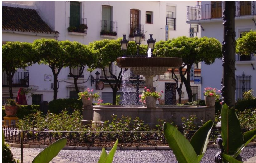
La plaza de las flores de Estepona, Málaga, Spain.

It would seem a trivial, unimportant example, were it not for the fact that this description comes from a blind man who has been blind since he was three years old. He speaks of narrow staircases or an opaque voice, how is it possible for a blind person to perceive such visual parameters? Actually, it is possible to hear architecture. Blind people have a much more developed sense of hearing and can detect the proximity or distance of objects by the echo of their footsteps. Virtually all architectural spaces project sound in one way or another, and Rodrigo simply used his hearing to perceive the place. In addition, the great Saguntino surprises us with music for ballet or cinema, and also with his extraordinary Concierto de Aranjuez , undoubtedly the best sound portrait of the city of Madrid.