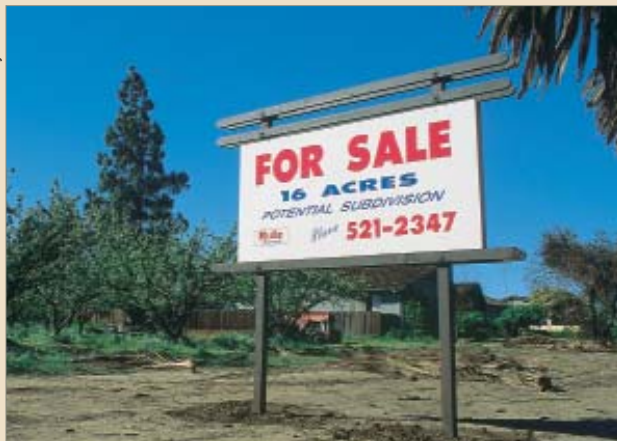
In California's agriculturally rich Central Valley, community leaders had generally positive impressions about easements but there were few enthusiastic supporters. In Patterson, land was offered for subdivision.