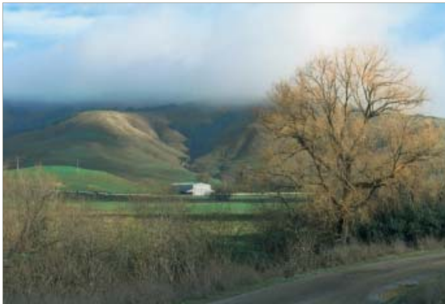
Marin Agricultural Land Trust

We extensively interviewed 46 landowners in two northern Bay Area counties and nearby Yolo County to assess their satisfaction with agricultural conservation easements. The landowners in most cases were enthusiastic sellers of the easements; their motivations included cash, keeping land in the family and conservation. They reported generally satisfactory experiences with the easement programs. To a lesser degree they expressed concerns about certain aspects of the easement process, especially negotiations and monitoring, and suggested ways that easement programs can improve their relationships with landowners.