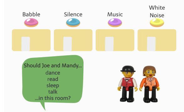
Figure 1: Experimental setup and stimuli. Participants were shown four wooden houses, each with an associated sound [instrumental music, multi-talker babble, silence, white noise], and a list of four activities [dance, read, sleep, talk] that two characters in the game wanted to complete. Participants determined whether the two characters should or should not complete an activity in each of the four houses. Responses were independent of each other.

Participants 72 children (3;0 - 5;11 years, mean age = 4.46 years, 4.2% African American/Black, 23.6% Asian American/Pacific Islander, 27.8% Caucasian/White, 8.3% Hispanic/Latinx, 26.4% Multiracial, 8.3% Other) were recruited from either a local Bay Area nursery school or children's museum. Participants were typically developing, had normal or corrected-to-normal vision, and heard English at least 75% of the time at home. An additional 6 children were ultimately excluded from analysis due to response bias (provided the same pattern of responses for 100% of trials), experimenter error, or severe lapses in attention. All exclusion criteria