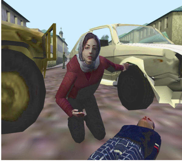
Figure 1: A scene from the Mission Rehearsal Exercise the resulting plan relate to overall emotional state and its dynamics. Another key issue concerns the agents' behaviors. They must interact with human participants across a range of modalities in a way that appropriately conveys their underlying emotional state. The wide repertoire of human nonverbal behaviors must be modeled, both subtle and extreme behaviors, consistent with emotional state. Fundamental questions arise as to what behaviors are exhibited and how various cognitive and emotional factors mediate between alternative behaviors. Finally, the realism of these simulations affords a unique, albeit weak, form of evaluation. The realism here supports more direct comparison with human behavior under matching conditions.

In essence, we are suggesting that it can be useful to attack the emotion conundrum head on via comprehensive, realistic simulations. Such simulations raise interesting research questions for cognitive science. Indeed the relation is synergistic since research on human cognition and emotion drives the design of our models.