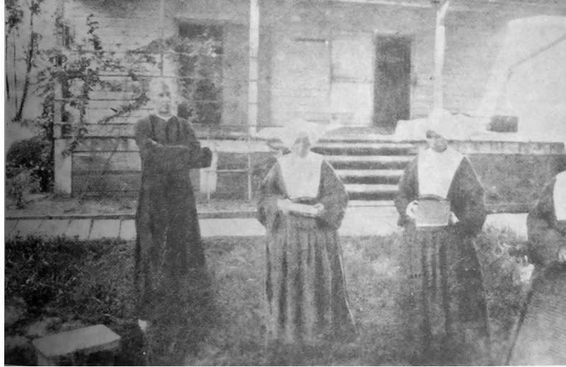
Figure 4.1. The Indian Camp Slave Quarters: 1896 photo of the unused slave cabin on what was then called the “Indian Camp Plantation,” the location on which the Carville Leprosarium would be built. Image taken from Stanly Stein’s 1963 memoir, Alone No Longer: The Story of a Man Who Refused to Be One of the Living Dead!

The Indian Camp served as a sugar plantation before collapsing as a failed business, when it was then abandoned as “unused” land from the 1870s to the 1890s. In 1894, the state of Louisiana acquired a five-year lease to refashion the property’s slave quarters into a secret medical research institute. The first patients—only seven, transported from the New Orleans area—were secretly interned after being diagnosed with leprosy. Due to the public concern over the disease and its contagiousness, particularly in the densely populated port city of New Orleans, those patients were covertly shipped (approximately 60 miles from New Orleans) to the facility on a coal barge down the Mississippi River, earning the name for its patients “the secret people.” 98