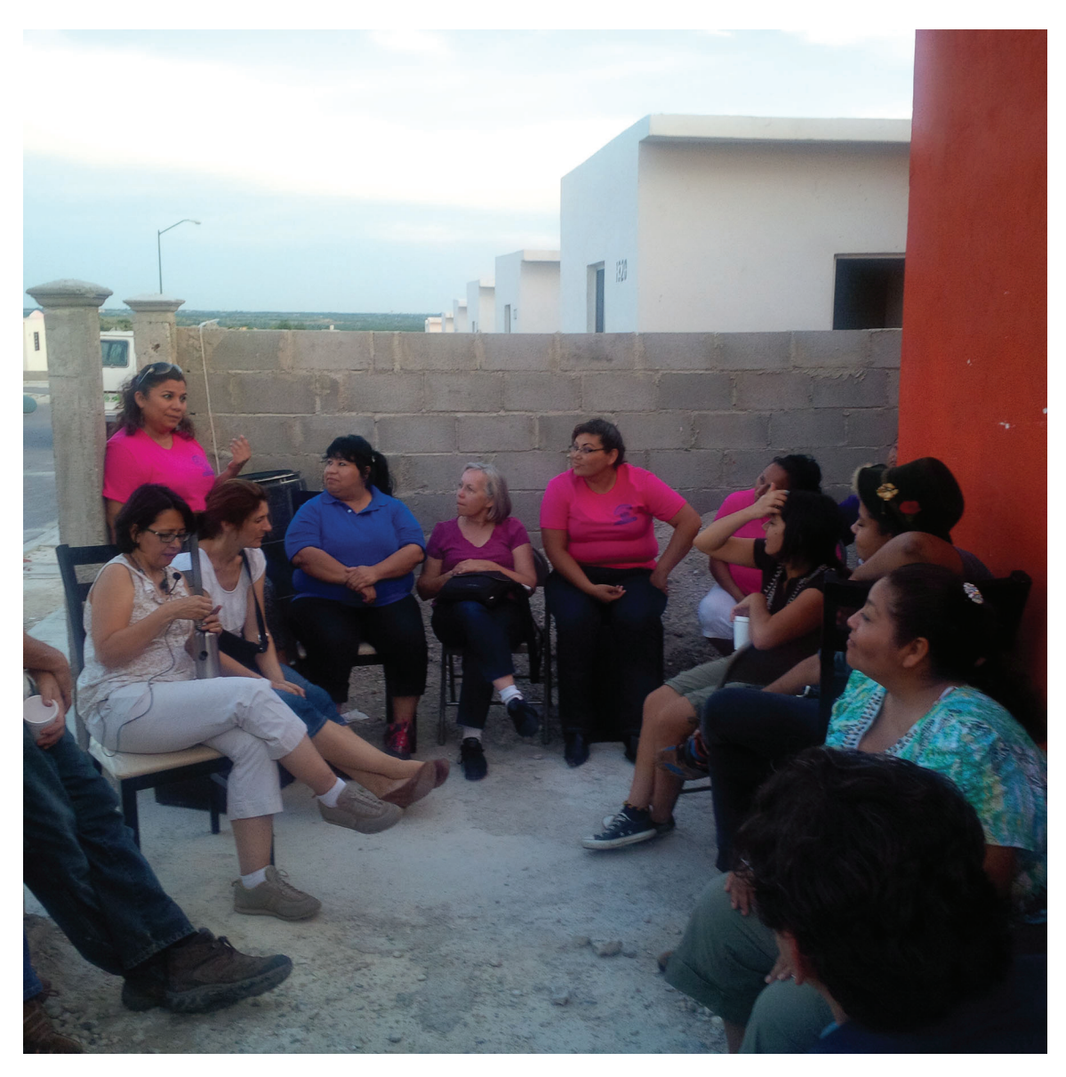
Solidarity delegation talking with maquiladora workers.

to discourage the workers in their fight for freedom of association." The board also ordered a new election to determine which union workers at PKC want as their representative.