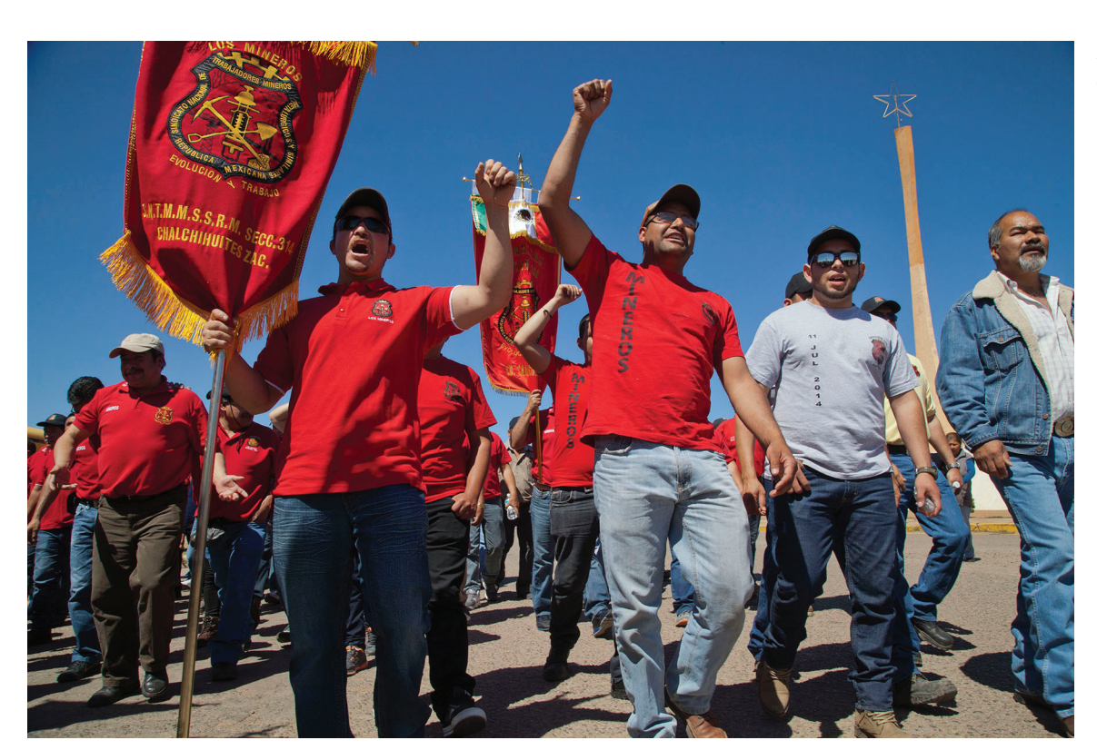
Miners came from all over Mexico to march with the strikers in Cananea.

rashes, and doctors finally told her they were due to heavy metal exposure.