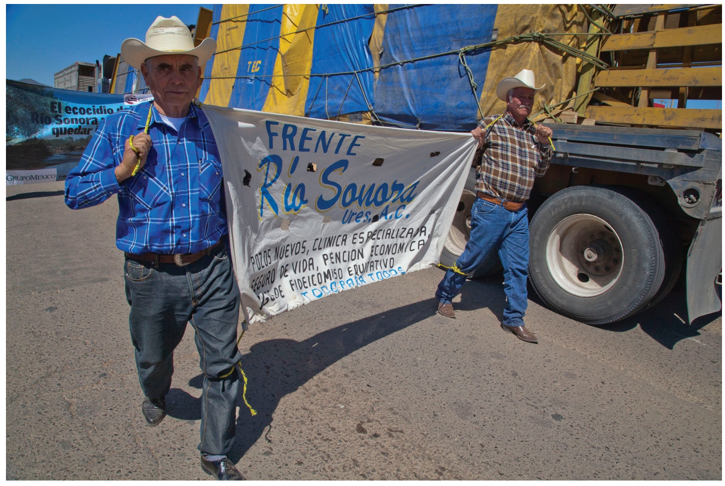
Farmers from the Rio Sonora valley march with striking miners in Cananea. Together they formed the Frente Rio Sonora to confront Grupo Mexico.

workers are still working under the terms of the agreement, subject to a 15-day notice to terminate it.