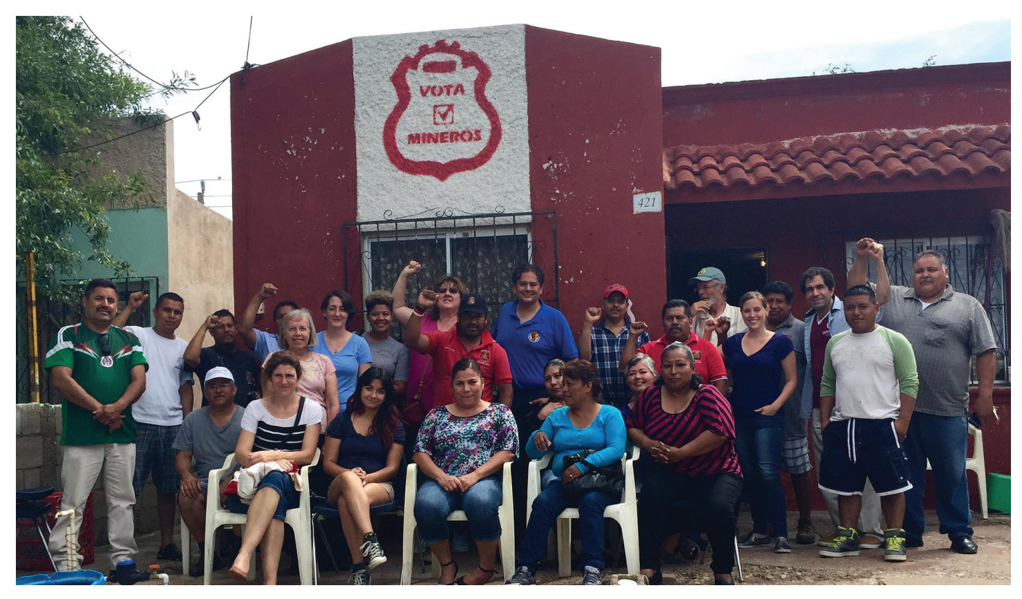
Solidarity delegation in Ciudad Acuña