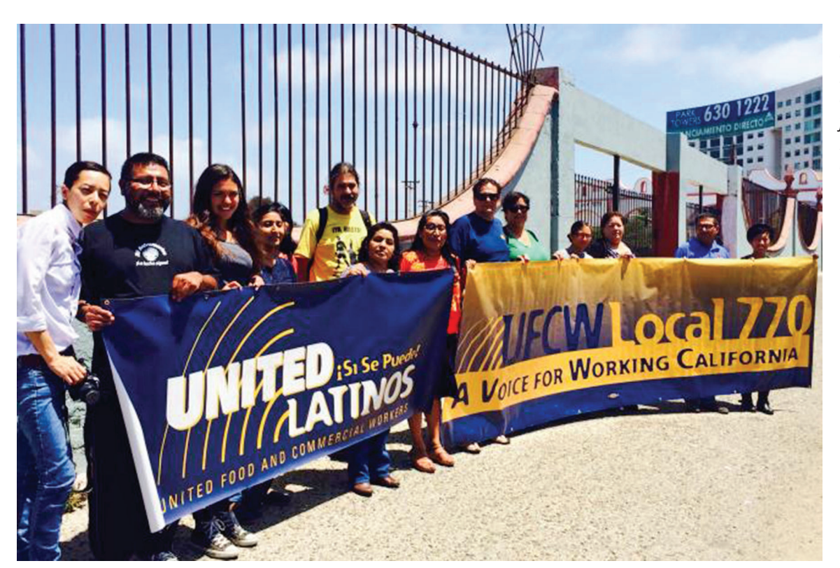
Unions and workers' centers in the U.S. and Mexico cooperated on a training session for farm workers in Baja California about organizing tactics.

sisters in Mexico because we're struggling for many of the same things in the United States."