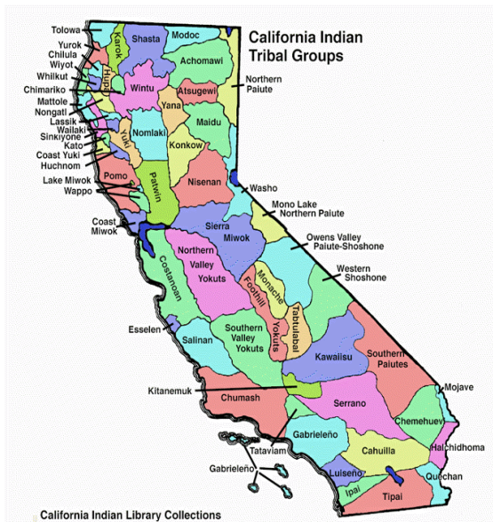
Figure 1. Native American Tribes in California.