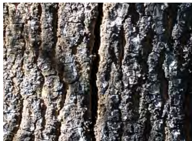
Figure 4. Cracked bark.