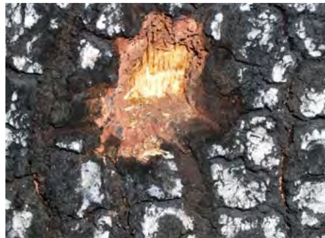
Figure 3. Live cambium.