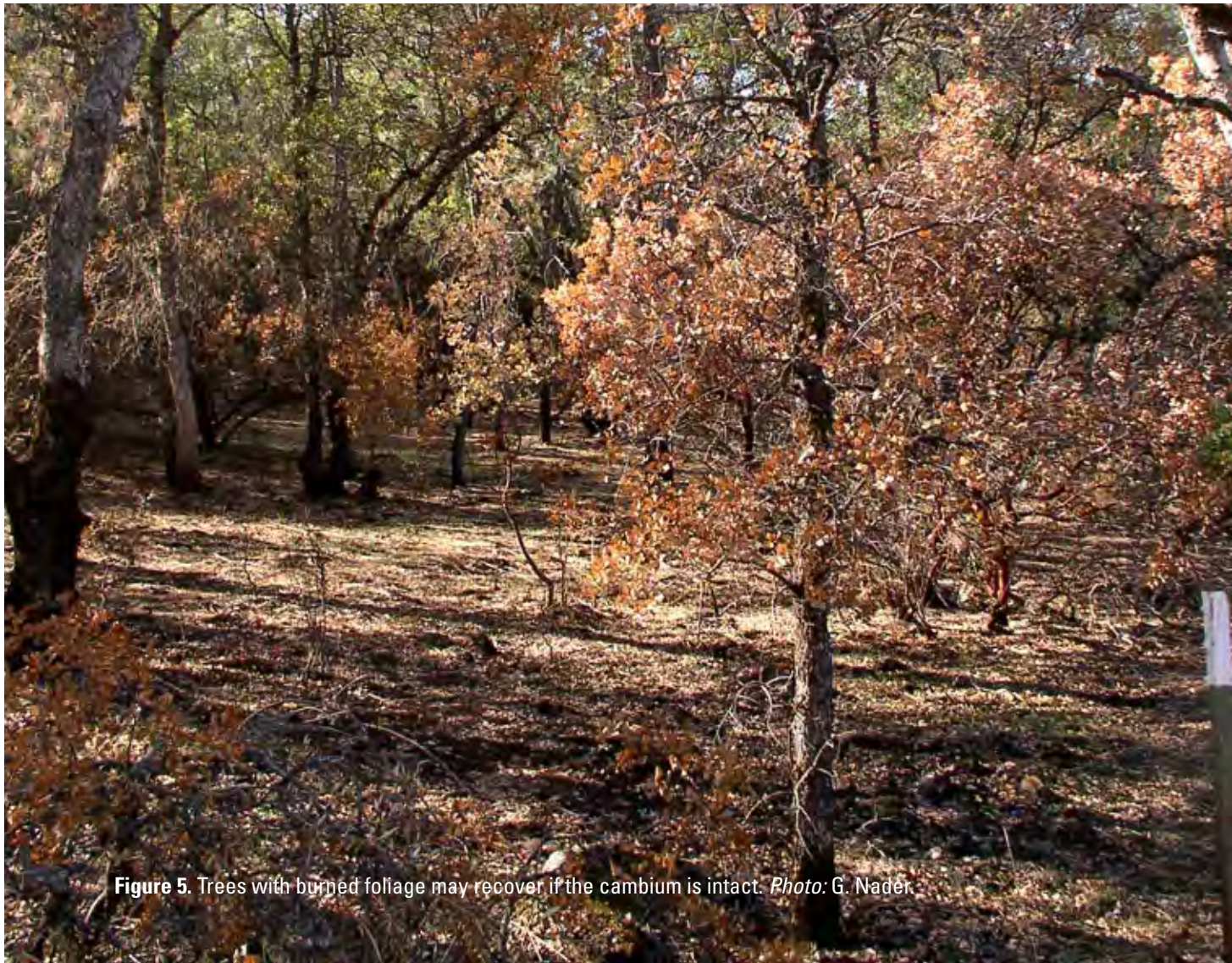
Figure 5. Trees with burned foliage may recover if the cambium is intact.