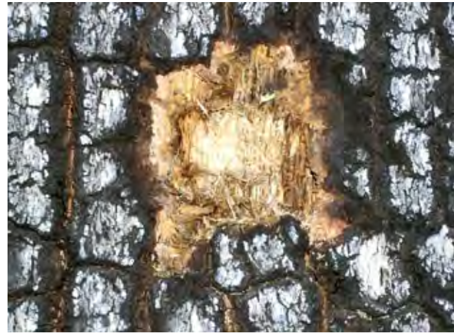
Figure 2. Dead cambium.

In general, leaf injury is much less damaging to the tree than stem injury. Trees that have had most or all of their foliage burned off will likely recover if the cambium is intact (fig. 5). Both deciduous and live oaks produce some new foliage each year. Thus, if the only apparent damage to the trees is scorched leaves, the tree will likely leaf out and grow normally next spring.