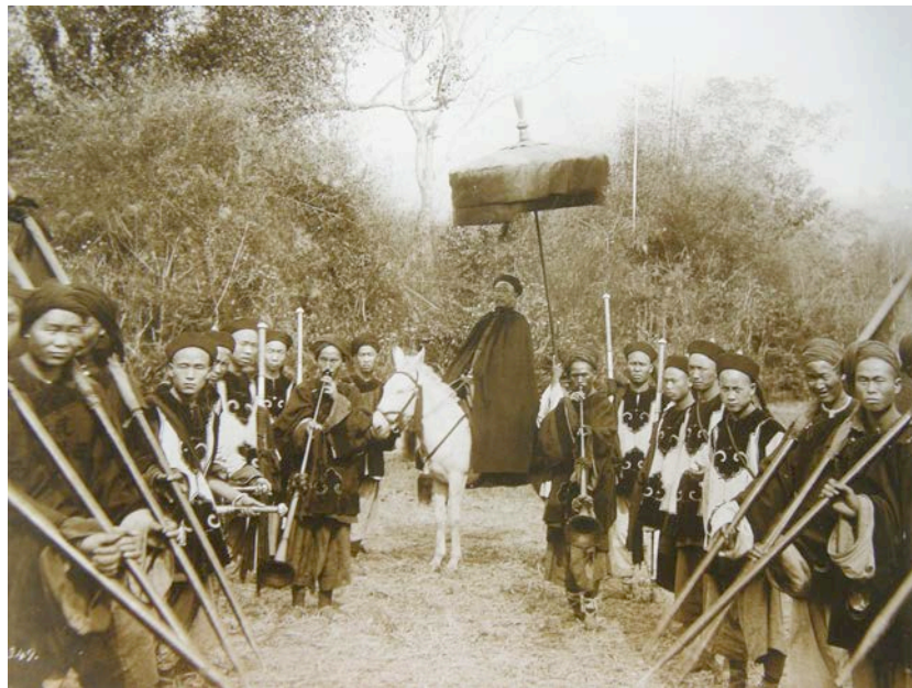
Figure 6. Chinese official with bodyguard during the boundary commission, 1899.