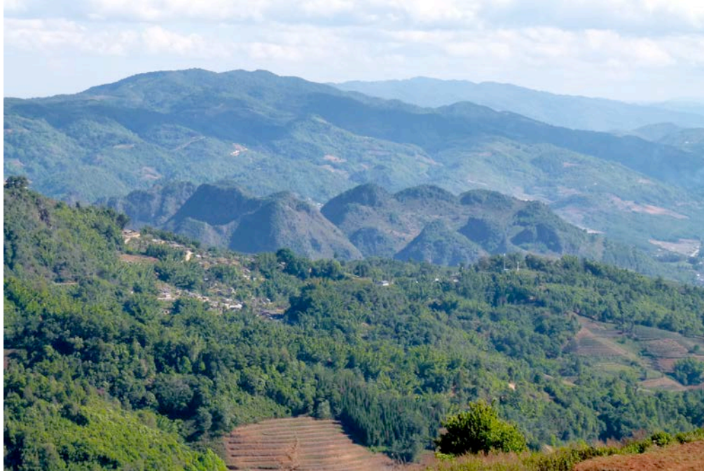
Figure 4. The Luohei Mountains in the middle of Lancang County, close to the Munai mines.

with Yangjing (杨经 or 杨金) on the eastern side of the Mekong River in the Weiyuan and Simao Mountains. The two men were the leaders of the future Luohei resistance (YST 1805).