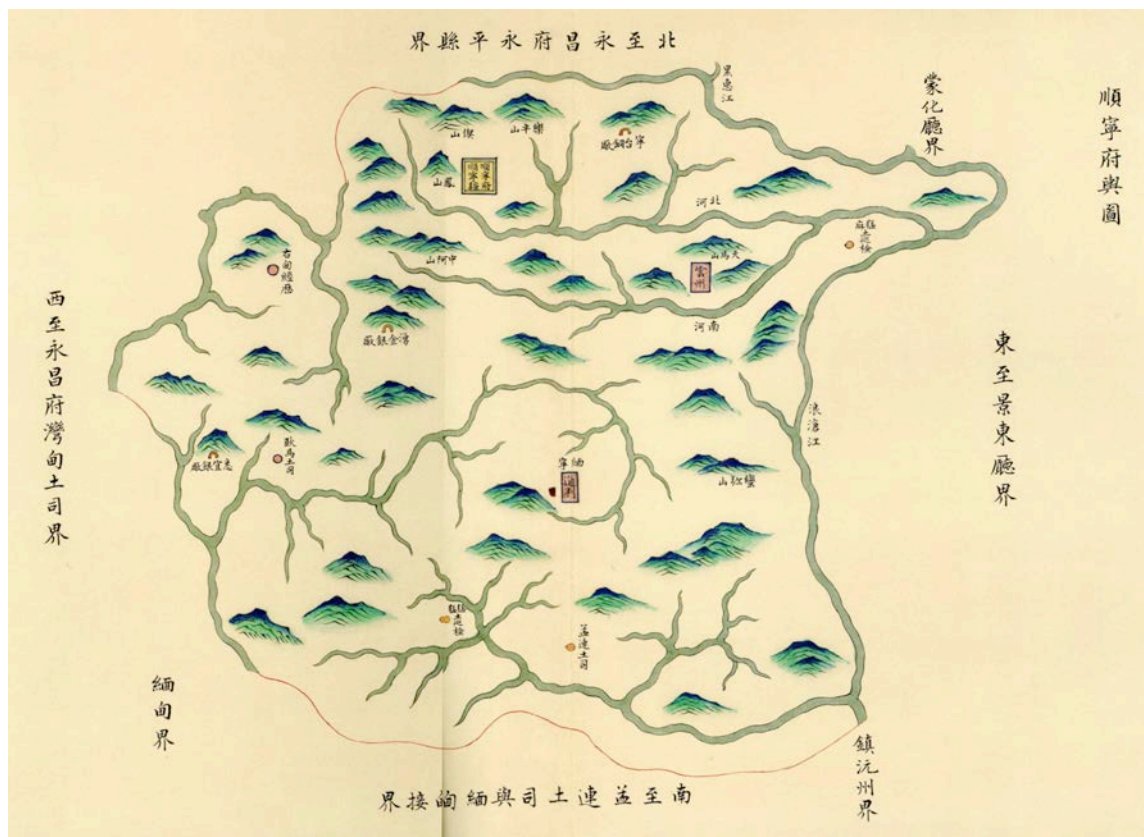
Figure 3. Map of Shunning Prefecture, 1818.

Following the changes in salt and tea policy, which were enforced to control mountain resources, the Qing government carried out political reforms to abolish the chieftains. These reforms in turn seriously influenced the daily life of indigenous communities, such as the Luohei, Woni, Dai, and other communities along the Weiyuan River and in the mountainous tea plantation areas in the newly established Puer Prefecture.