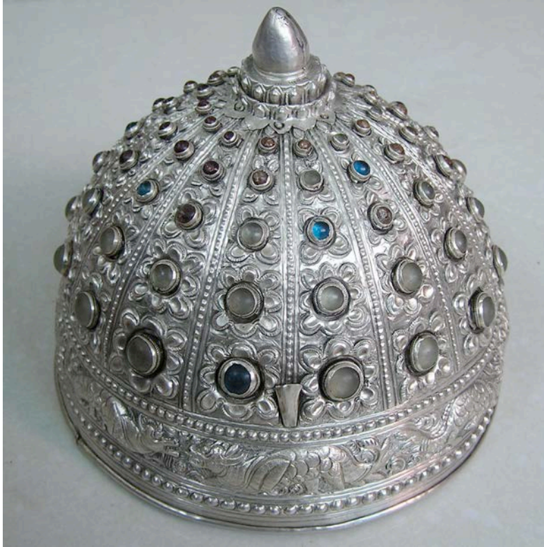
Figure 1. The silver hat of E Sha Buddha.

kingdom. These monks-cum-political leaders still maintained their subordinate roles as low-level “local chieftains” ( tumu 土目), however. They interacted with the Qing state for many years, until the Qing government finally destroyed the system in response to social changes taking place in Burma with the coming of British colonial power after 1885.